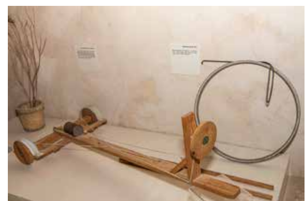
Trolley and bike rim toys can be seen in the Mangazina di Rei museum