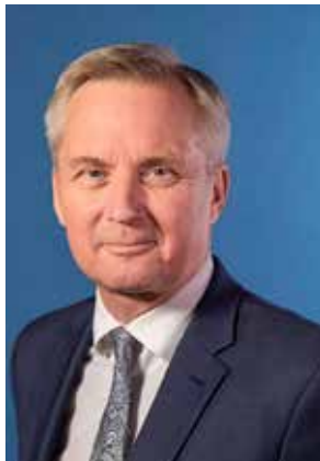
Eric van der Burg, State Secretary Kingdom Relations

State Secretary Van der Burg will soon see with his own eyes the crisis that has developed at the Lagún landfill site over the years. He is presently visiting the Caribbean part of the Kingdom from April 7 to 17. While on Bonaire he will inspect the landfill and meet with local residents who are most affected by the smoke and pollution. DMR