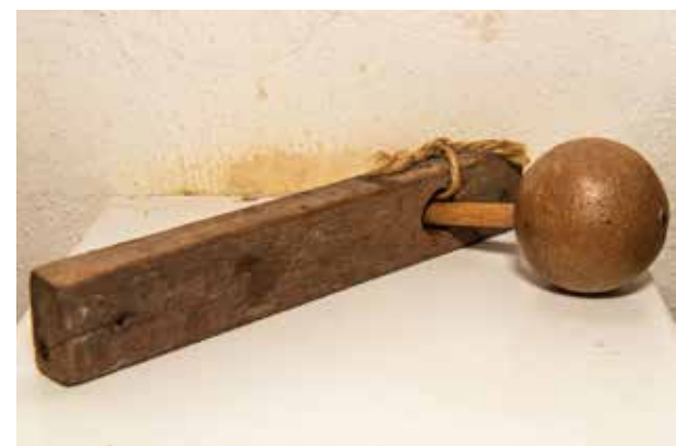
A handmade top on display in the Mangazina di Rei museum