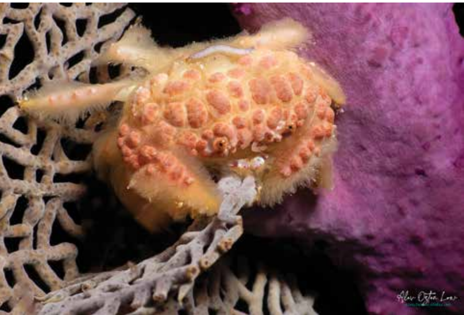
Hoary Rubble Crab.

A local diver's nighttime find is sparking global interest after capturing never before seen crab behavior. During a night dive at Tori's Reef on Bonaire, local naturalist and photographer Alev Ozten Low captured something no one had ever officially documented before: the tiny hoary rubble crab ( Banareia palmeri ) was observed cutting off and carrying away the tip of a live coral. This was the second time she had photographed this crab, the first time being 5 years ago at a Northern dive site where two other individuals were observed, one cutting a sea fan and the other a soft coral. This fascinating behavior reveals that this elusive crab might actually be a coral predator living among the reefs of the Dutch Caribbean. Working together with marine biologists from Naturalis Biodiversity Center, this unique crab behavior was recently described in a newly published scientific article , highlighting the value of combining local observations with academic research to uncover new insights into the Dutch Caribbean's marine life.