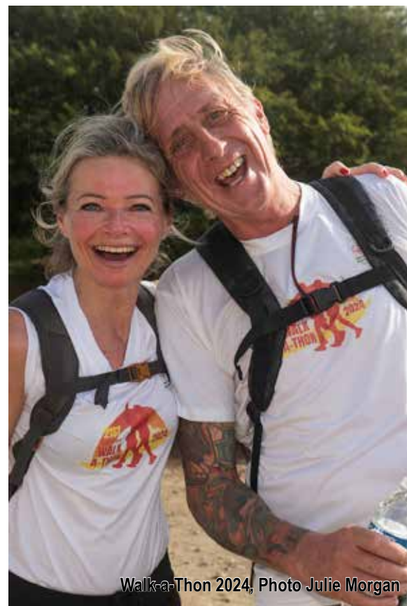
Walk-a-Thon 2024

Mark your calendar for the Special Olympics Walk-a-Thon 2025 held May 4. Bring your friends and family to walk or bike the 30k distance from White Slave to Rincon to raise funds for Bonaire's Special Olympics team. More details on Special Olympics Bonaire on Facebook.