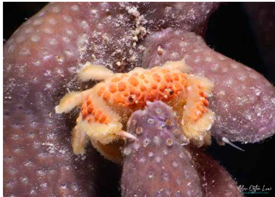
Hoary Rubble Crab.