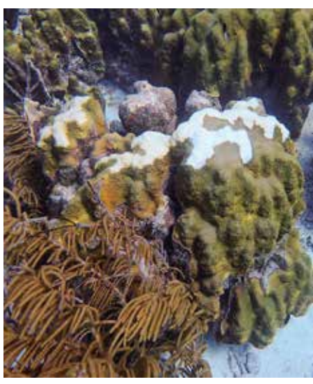
6. Parrotfish biting