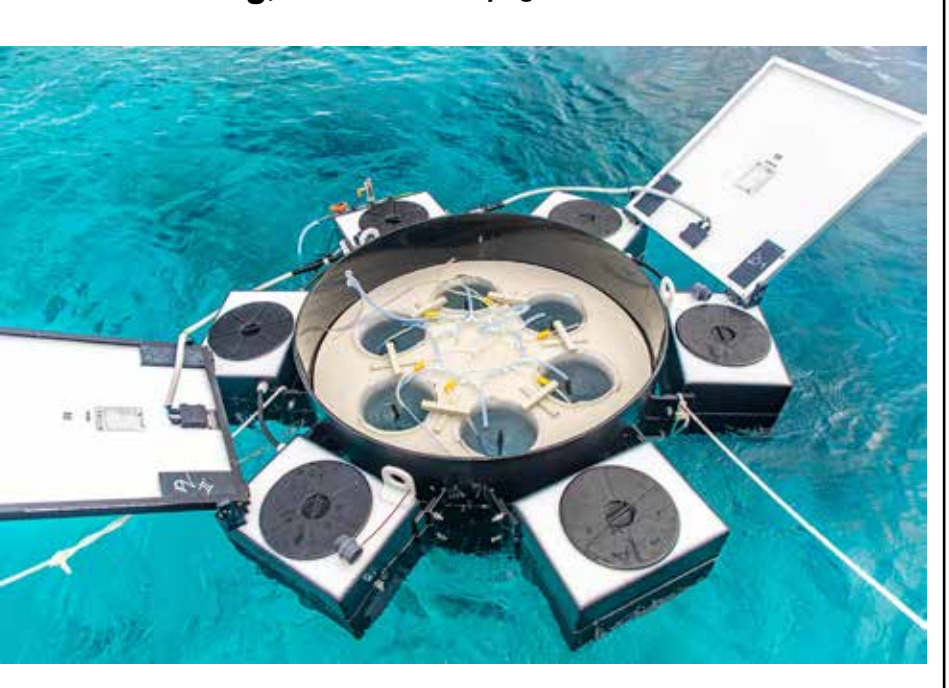
The six incubators are surrounded by the stabilizing boxes in a hexagon shape with the two flaps for the solar panels (not in place).

Bonaire. These species are very important gardeners of the reef because they remove algae. Van Lopik explained that, for example, reef renewal (all reef conservation efforts) wouldn't be successful without the grazers.