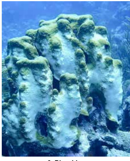
8. Bleaching

Did You Know: Coral Disease, Biting & Bleaching continued on page 13