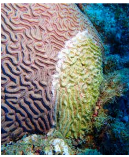
3. White Plague