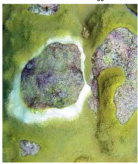
2. Yellow Band Disease