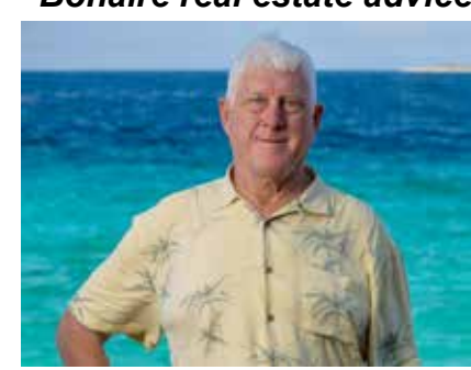
I'm thinking about listing my house for sale. What should I consider besides the selling price?