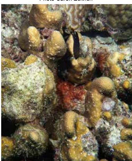
7. Damselfish biting