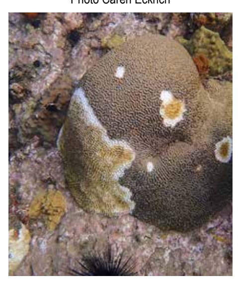
4. Stony Coral Tissue Loss Disease