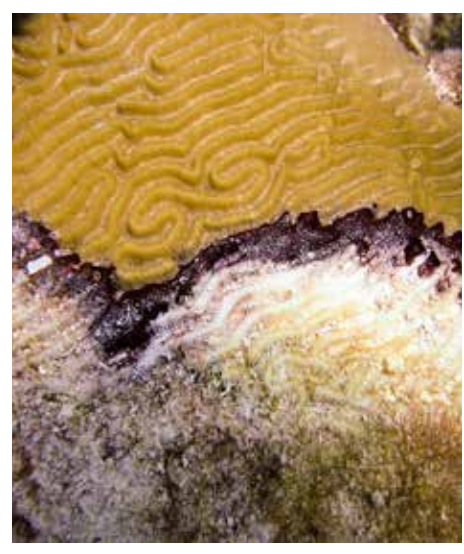
1. Black Band Disease

6. Parrotfish biting – parrotfish will often bite corals, leaving large white marks where you can see that the coral skeleton is damaged (this doesn't happen with disease). Sometimes the parrotfish will keep