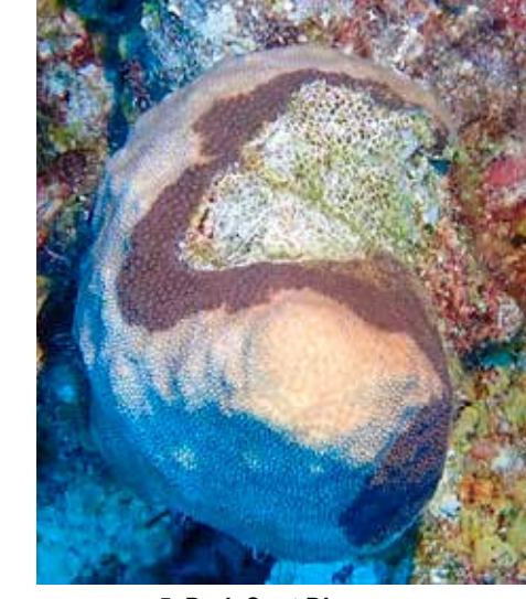
5. Dark Spot Disease Photo Caren Eckrich