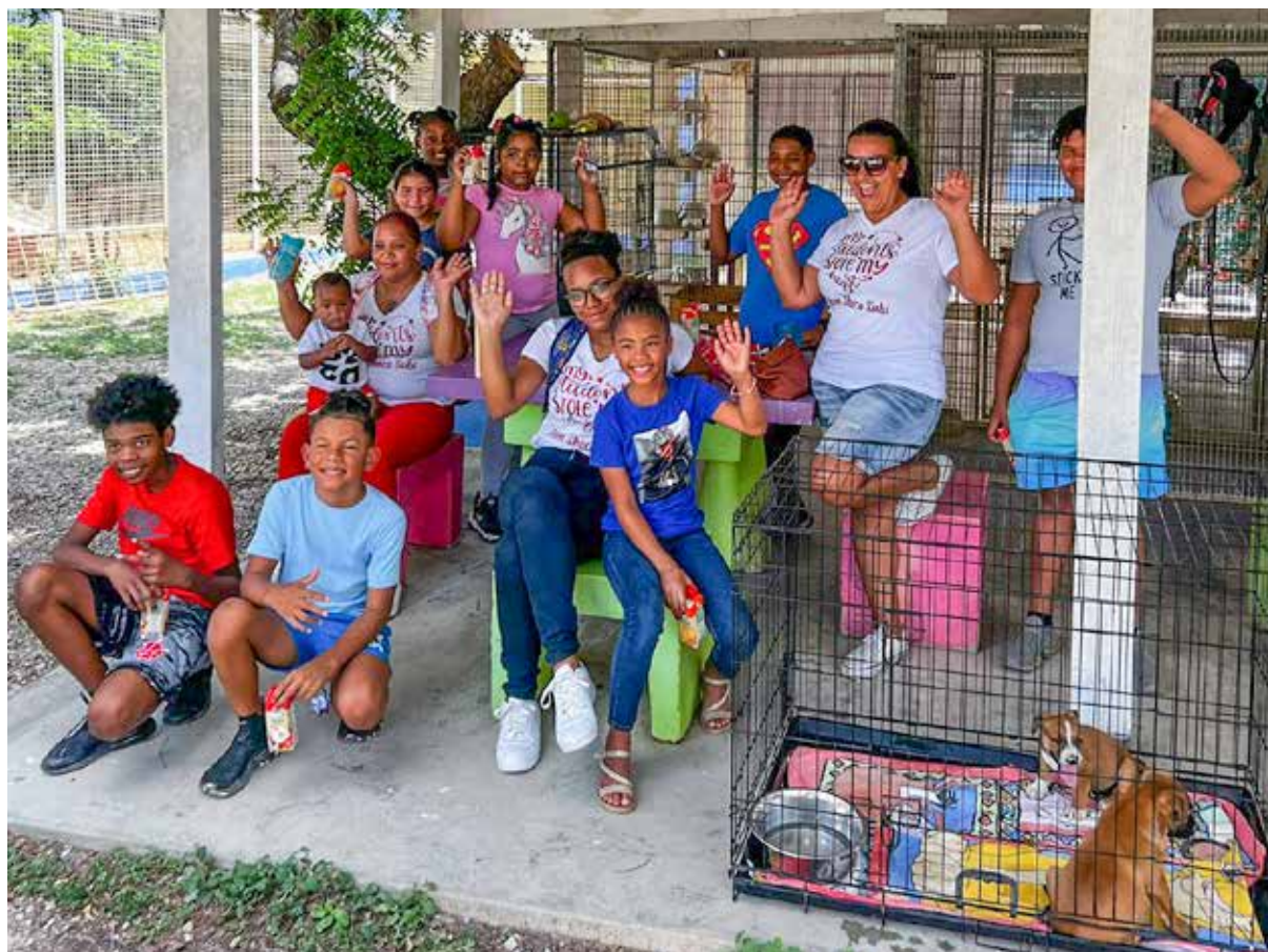
Kids celebrate World Animal Day

Several childcare centers visited Animal Shelter Bonaire in celebration of World Animal Day on October 4. Children from Childcare Bon Kwido, Elephants Splash, E Shoco Sabí and others were a part of the school trip. Shelter staff instructed the kids about animal care. They were allowed to spoil the dogs with a delicious dog treat.