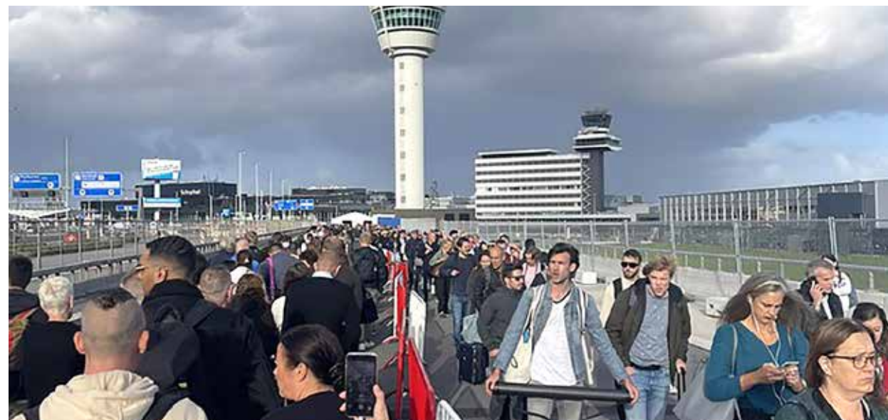
Lines at Schiphol on Sept. 17, 2022.

KLM's has scheduled flights to 163 destinations this winter. Those are its plans at least. Currently it is being forced to cancel flights because of grim under-staffing in many service positions at Schiphol. The waits to pass through Security are running as long as four hours, for instance. The lines extend outside the terminal. DMR.