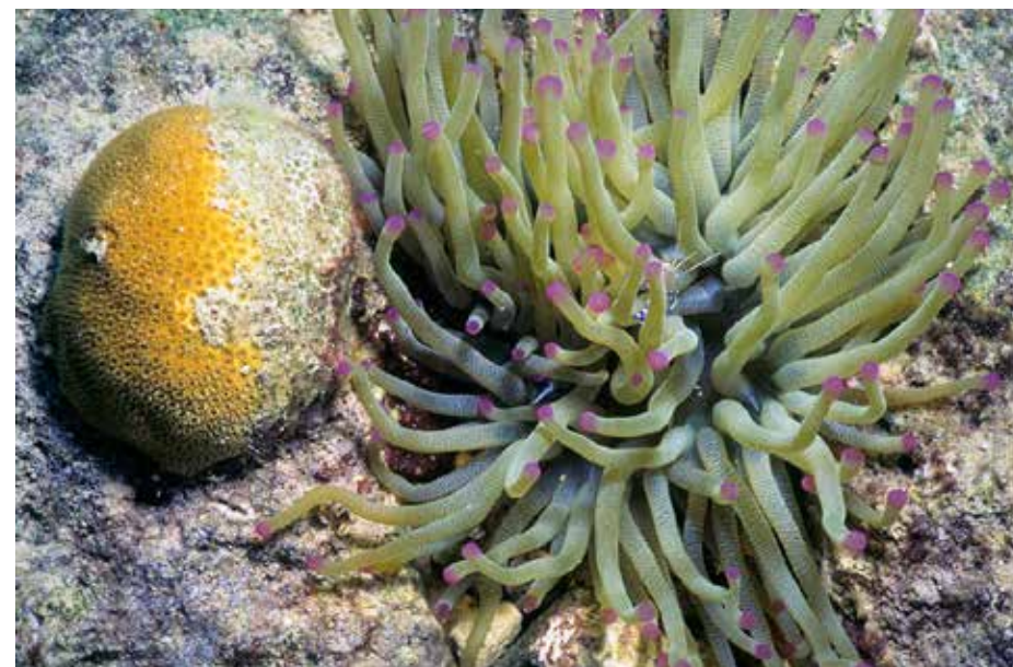
This anemone has killed the polyps it can reach of the nearby coral colony.

al's Reef (for children); in Dive Training Magazine from 1990 to 2000, with "Coral Glimpses" in the Bonaire Reporter, and now with "Reef Glimpses." The Bonaire Reporter is delighted to bring "Reef Glimpses" to you free of charge. Dee's books are available for purchase at the Carib Inn on Bonaire or through touchthesea.com.