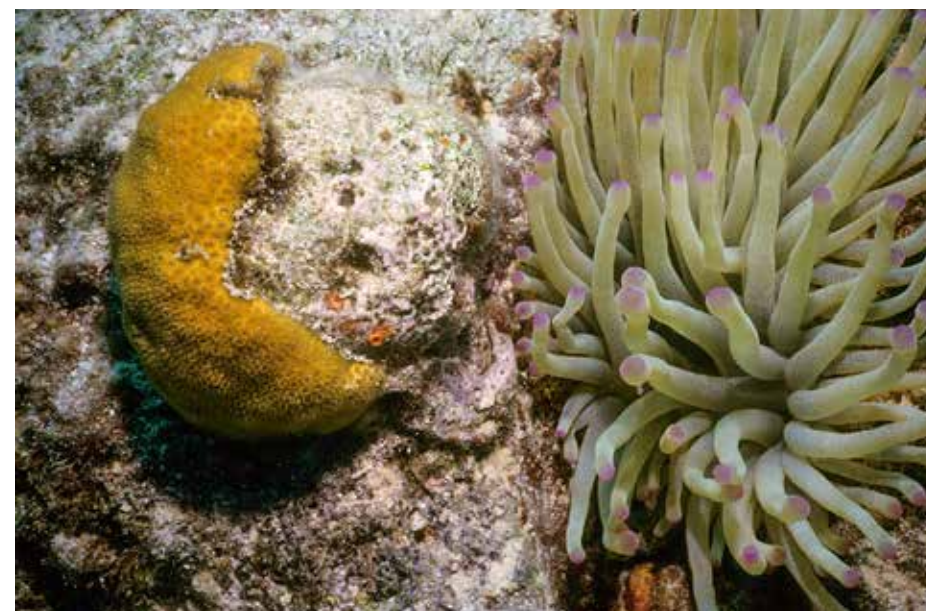
A few years later, the anemone still reaches the coral colony; all new growth on that side of the coral has been prevented by the anemone's tentacles. The polyps on the unaffected side of the coral head, however, have grown about 2/3" (17mm).