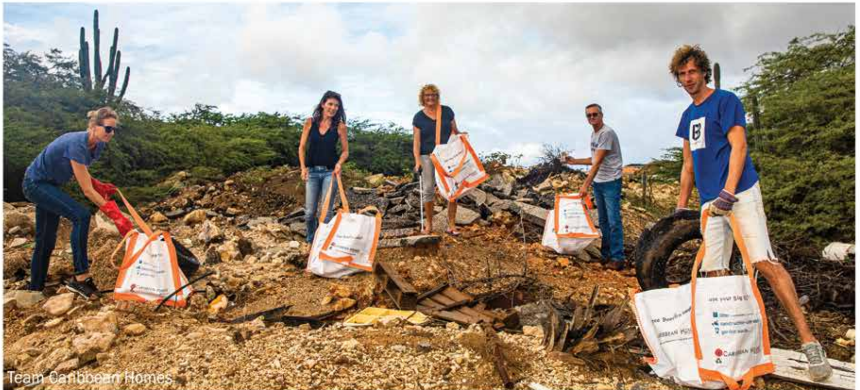
Team Caribbean Homes

Look at roadsides, kunukus, mondi, beaches (west & east), streets.