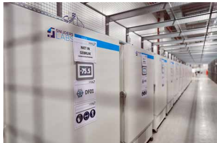
Photo: Freezers used in the Netherlands

Vaccination takes place in stages on Bonaire. “In the first phase, people aged 70 and older are vaccinated and the healthcare personnel. Then it is the turn of the over-60s and people who are in a risk group. For example, people with cardiovascular disease, lung disease, diabetes. Later the healthy people from 18 years to 60 years are vaccinated.”