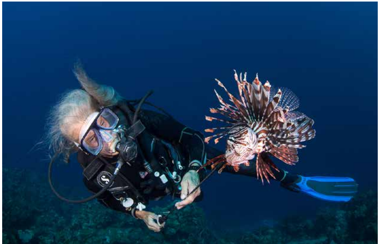
A local certified lionfish hunter removes one of the invading fish from Bonaire's reefs.

that lionfish can survive for up to three months without food and lose only 10% of their body weight?