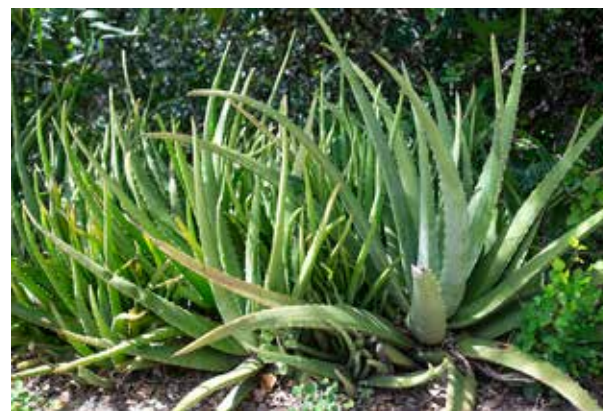
Aloe is common on Bonaire

A Garden? Just Do It! New Year's cleansing.