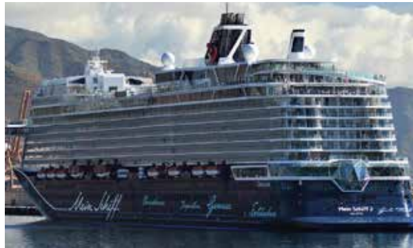
The Mein Schiff 5, pictured here, is a sister ship to the Mein Schiff 2 which has docked in Bonaire.

widely seen as a success in the fight against COVID-19, with just over 206,000 cases and 9,201 fatalities, about one-fifth of the death toll in the U.K.