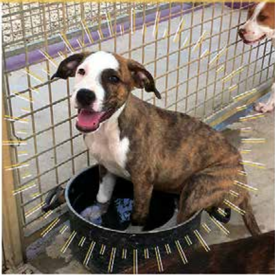
Photo model: WOODY! Available for adoption! He is a four-month old puppy who loves to stay cool. Come visit Woody or any of our other amazing adoptable cats or dogs.

Summer has arrived in the southern Caribbean! Bonaire, along with the entire world, feels a bit different this year with the COVID pandemic, but the changing of the seasons always remains. With all that is going on around us we must not forget to take care of our beloved pets during the hottest time of the year. Below are a few key tips to keep in mind to ensure the health and safety of your furry family member: