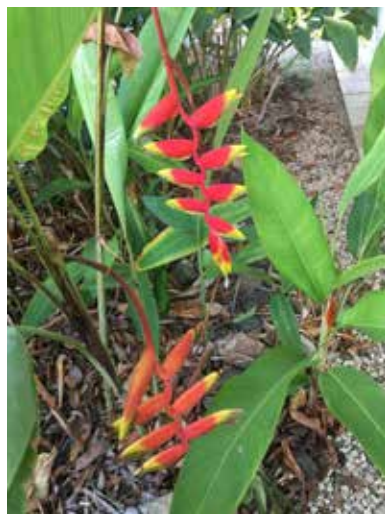
Because of the rain the heliconias have an awesome flower

With all the rain showers, it's time for big gardening.