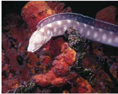
This sharptail eel is swimming along some sponges.