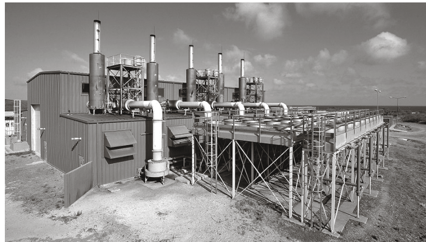
Generators at Contour-Global

The other storage terminal, for HVO, will be built adjacent to the Contour Global power plant. According to the government, the oil will be transferred to Contour Global by pipeline after being offloaded