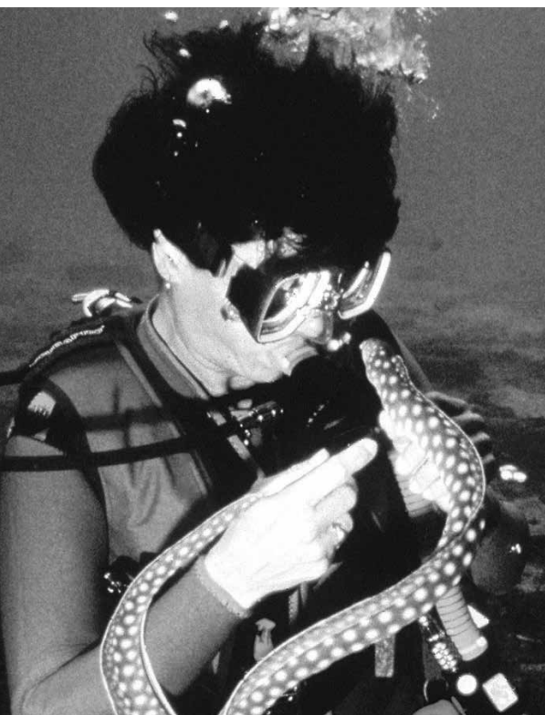
Ms. Piggy and I.

eels allow divers to get so close to them.