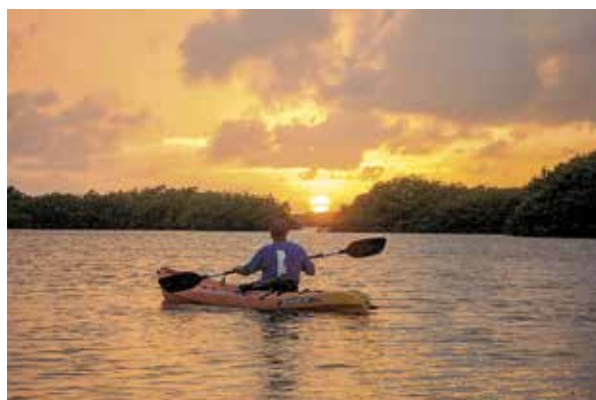
Kayaking in the mangroves.

Amidst the threat of Covid 19, everyone's lifestyle has suddenly changed. On Bonaire, daily life has been altered even though the virus has yet to land here. And, the local government and everyone is working hard to keep it that way. First, by government order, the flights