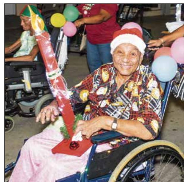
Bonaire's seniors in the elderly parade enjoy the night's celebrations.

The Bonaire Reporter would like to thank our readers. We wish everyone a wonderful holiday season.