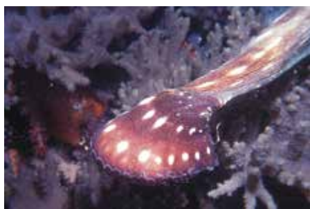
Male octopus arm specialized for mating

On a tropical Pacific reef, I turned a corner and disturbed this octopus before I had any idea it was there. I got one photo of his unusual arm as the octopus departed.