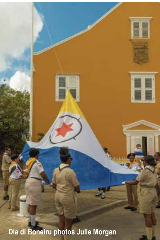
Dia di Boneiru