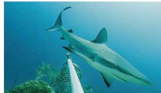
Underwater image of a Caribbean reef shark caught on camera by BRUV.