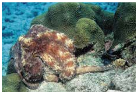
A male octopus on the left places a sperm packet into the mantle of the female

Later I learned that one arm of every male octopus is specialized for mating: this is the arm which selects a sperm packet and places it into position under the mantle of the female. The design of the mating arm is different for each species of octopus, so those in the know could tell us exactly who this octopus was. The formal name of the mating arm is hectocotylus (heck-tow-KOTT-uh-luss), which means “hundred cups” and is particularly apt for the arm in the photo! In contrast, the common octopus – the one we see in dens around Bonaire -- has a more subtle design distinguishing its hectocotylized arm. From the top, it looks like his other arms. From underneath, though, you can see that the suckers of his mating arm are not in two neat lines like all the rest of his suckers, and that a few of them are oversized.