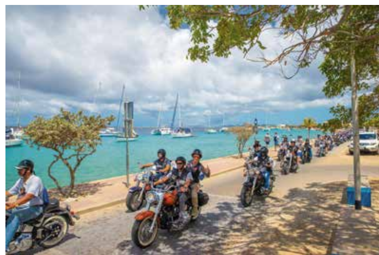
Iron Order Motorcycle Club held their annual four-day road rally funding a local charity. More than 250 riders attended the event.

The raising of the Bonairean flag by the local scout troops brought looks of pride and honor to the faces of those attending.