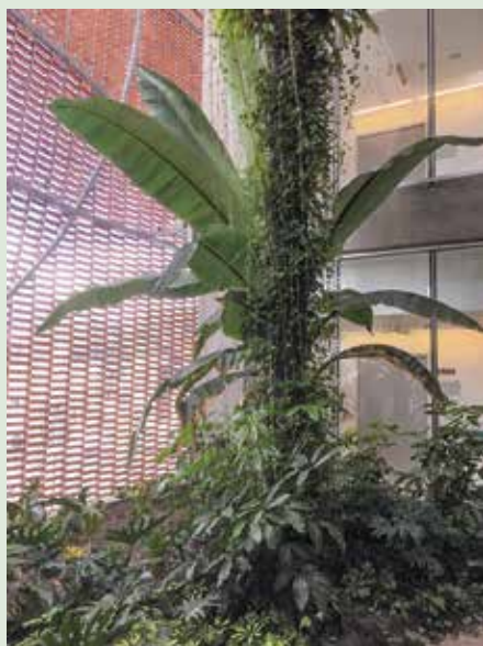
We need more green in the world.

Yes, CO2 is one of the biggest threats of the world. Scientists say that we can do something to bring down the amount of CO2. An easy way to help is to plant trees in our yards. If everybody on earth would plant a tree, we could reduce a good amount of the CO2. If you don't have a yard or garden, you can put plants on your porch or hang them on the wall of your balcony. Companies can grow plants against walls creating indoor jungles. WE NEED MORE GREEN IN THE WORLD, so why not start today with it. The longer we wait, the bigger the negative consequences are for all life on Earth. Plants give us oxygen and the more the better. For that reason we need