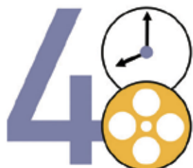
The 48 Hour Film Project