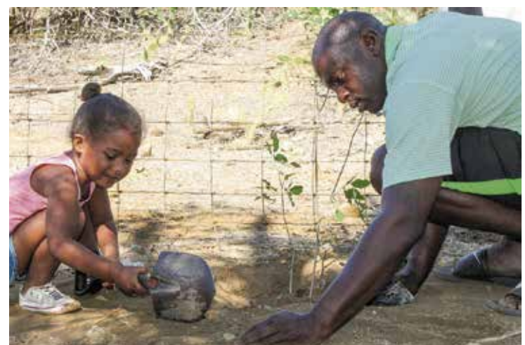
Little and big hands volunteer planting trees in Echo's ongoing reforestation project

JOIN US SEPT 22: Tree planting at Jankok. See details in story.