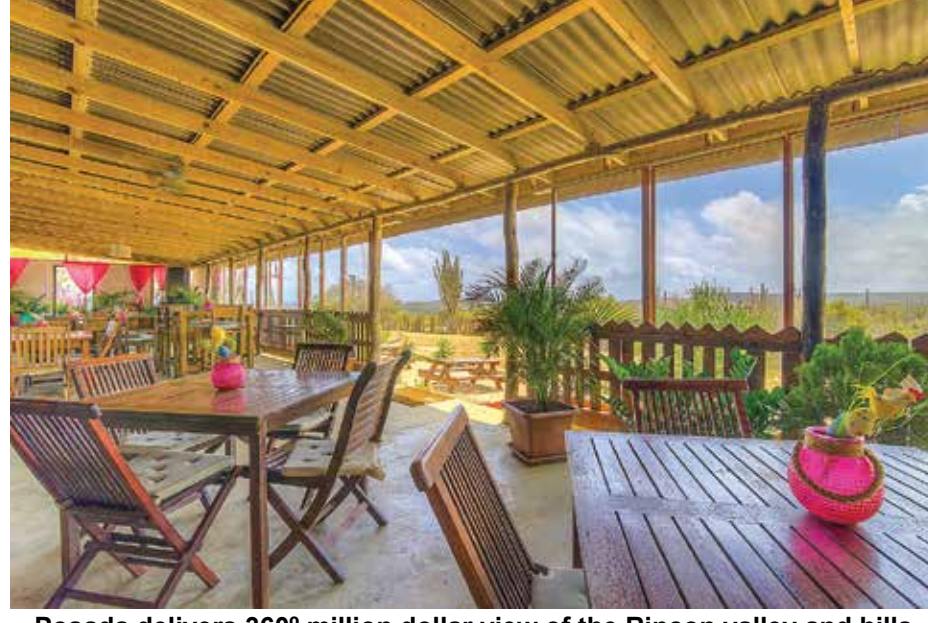
Posada delivers 360° million dollar view of the Rincon valley and hills from every seat in the house

For more information about Posada para Mira visit their website: posadaparamira@live.nl or call 717-2199/701-7060. Facebook: Posada Para Mira.