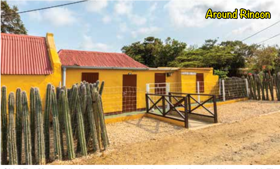
Chici Tan Museum is located in a historic home that is over 100 years old. The museum features local art, history and is landscaped with the perfect example of the cactus fence.