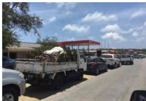
Long lines at Mentor pump.