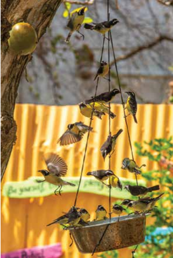
Bring your birding book to navigate the many birds that frequent the garden including bananaquits, loras, parakeets, hummingbirds and more.

The Gietmans say, what we really do is island promotion. They believe supporting the community is a lot of fun. They love Rincon and want the locals to know that they aren't here for just the tourists but also the locals.