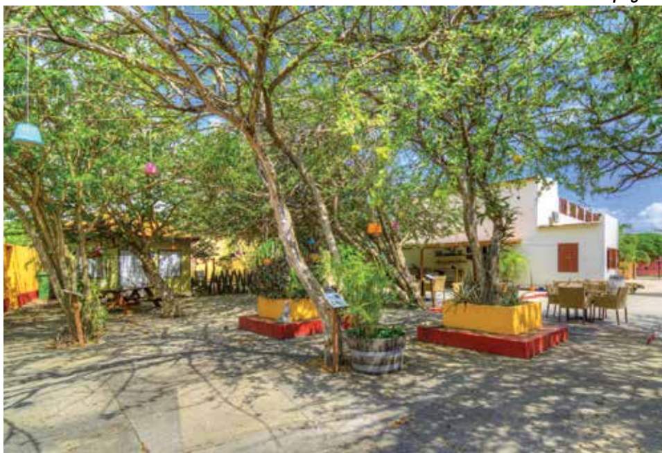
Cadushy garden is a great place for guests to relax and enjoy a cool beverage and the many birds that visit throughout the day.

In 1997, after many trips to Bonaire, they decided to dive in and make a permanent move to the island and start a business. For the last 10 years they had brainstormed about what they could do for work. Then they had what Eric called their 'Eureka!' moment. As tourists on the island they knew how difficult it was to find the perfect souvenir. There are only so many t-shirts and bags of salt