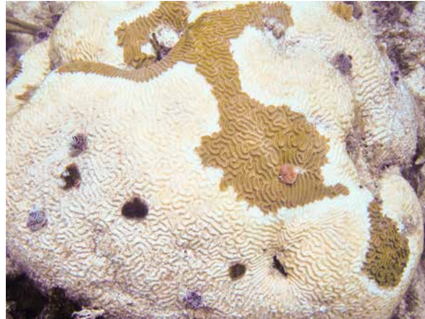
Brain coral in the Florida Keys affected by Stony Coral Tissue Loss Disease.

Compared to the wider Caribbean, Bonaire has some of the best reefs around; our reefs have more coral, more fish, and less algae than many reefs in the area. While some of our corals do occasionally bleach or get diseases, they are faring better than other corals in the Caribbean. Unfortunately, there is a new disease making the rounds in the Caribbean that seems to be spreading really quickly! Not only is this disease deadly to corals, there is very little that can be done to stop its spread. This worrying disease is called Stony Coral Tissue Loss Disease.