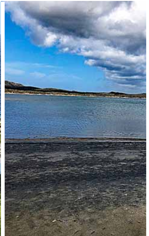
The barren shores of Gotomeer

It's well a documented fact that the quantity and quality of fish, turtles, lobster, conch and other fishery resources in our waters has been declining steadily, mostly due to overfishing, environmental stress and other issues. It's high time to take positive action to make things better and improve conditions on our reefs. Creating protected fish nurseries, like Lac Bay, is one answer. Given the current situation, the creation of mangrove bordered bays is a necessary step for Bonaire.