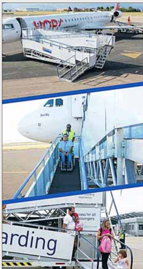
Where is our AVIRAMP?

Now that we are at it: how is the AVIRAMP coming along? Is it there yet? And