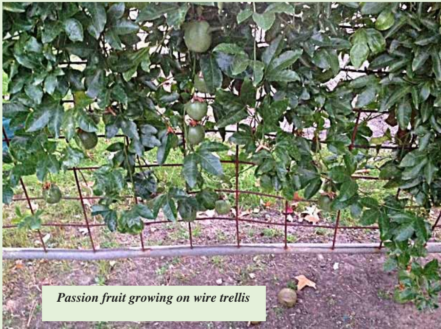
Passion fruit growing on wire trellis

Passion fruit. We see them much of the time in the stores and fruit markets. Passion fruit grows in other countries and is imported to Bonaire. But did you know that they are tropical plants that can