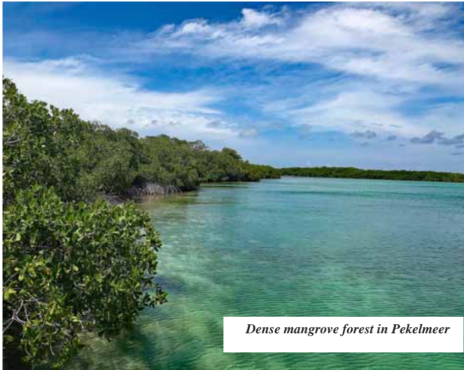
Dense mangrove forest in Pekelmeer

Create A New Lac Bay (Continued from page 8) of this and have diminished this positive effect by constantly using huge nets and ignoring sustainable fishing practices... that is taking all sea life regardless of size.