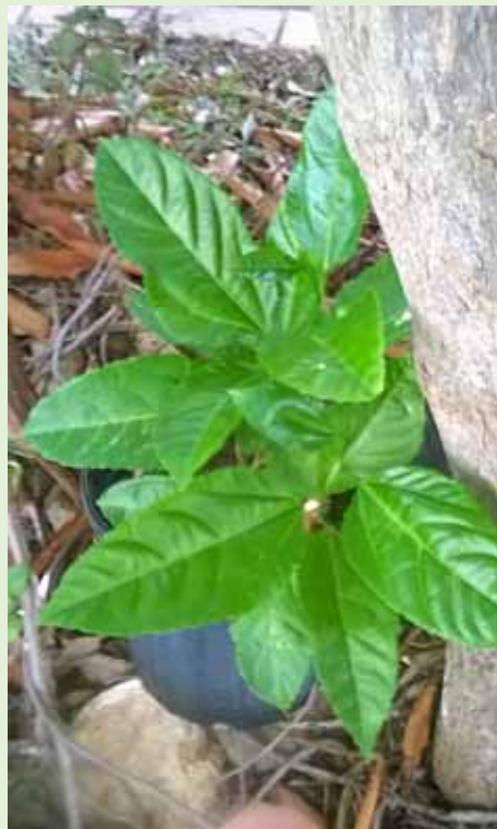
Passion fruit—Young vine starting

grow perfectly on Bonaire too? I have them all the time in my yard, growing in my trees. Right now I have three plants growing in the mango tree. The passion fruit is a vine that crawls and curls in the branches while enjoying the shade of the big tree. They are so easy to grow and the fruit is so healthy and nice in different recipes. But iguanas are crazy for the leaves so when the plant crawls in a big bushy tree the iguanas can't see the leaves that well. And that is my secret to growing passion fruit. It's so nice to see the many yellow or purple-reddish passion fruits hanging in the tree like Christmas decorations. You want to try it? Here have more interesting information.