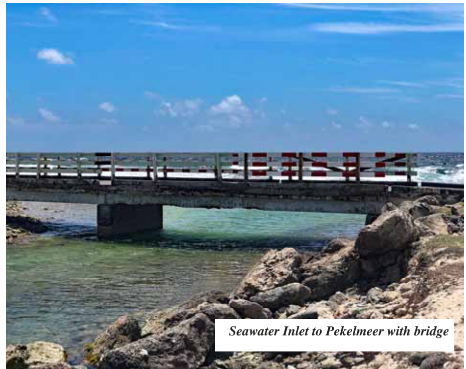
Seawater Inlet to Pekelmeer with bridge