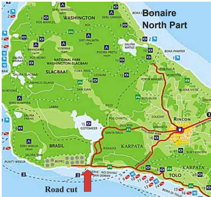
Gotomeer, is in Bonaire's NW corner, arrow shows road cut