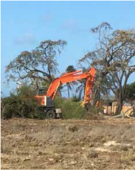
many of the old trees that grace the site remain healthy.

►According to Nina den Heyer of the Movementu di Pueblo Boneriano (MPB-“Blue Party”) 30% to 40% of Bonaire’s elderly can be considered living in poverty, compared to 4% in the European Netherlands. Bonaire’s top retirement benefit is $593/month and one out of four, about 600 people, have that as their only income. According to a report from the Central Bureau of Statistics, 20% of elderly people still work at a paid job.