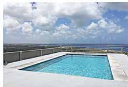
Sabadeco, Crown Terrace 33 US$1,900,000 🛏️6 🏠4