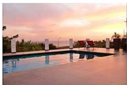
Sabadeco, Crown Court 15 US$995,000 🛏️5 🏠5