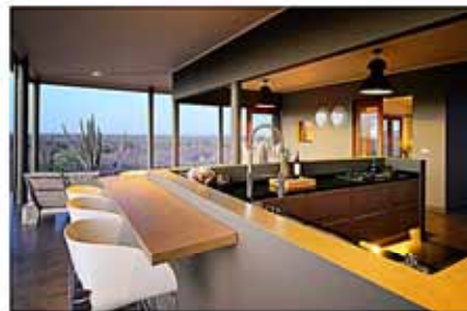
Bolivia, Luga Aleha 10 US$1,299,000 🛏️5 🏠5