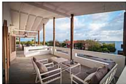
Sabadeco, Crown Court 20 US$878,000 🛏️5 🏠3.5