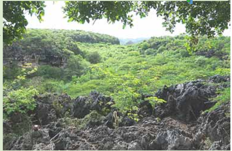
The beautiful Roi Sangu

The Echo Foundation, in collaboration with the Bonaire island government, has started preparing a new reforestation project in the Roi Sangu valley in the northwest of the island. Until now the roi was difficult to hike through or even to locate.