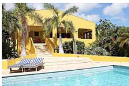
Sabadeco, Crown Shores 64 US$595,000 🛏️5 🏠4.5