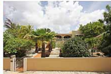
Santa Barbara, Kaya Kuarts 2 US$595,000 🛏️4 🏠3.5