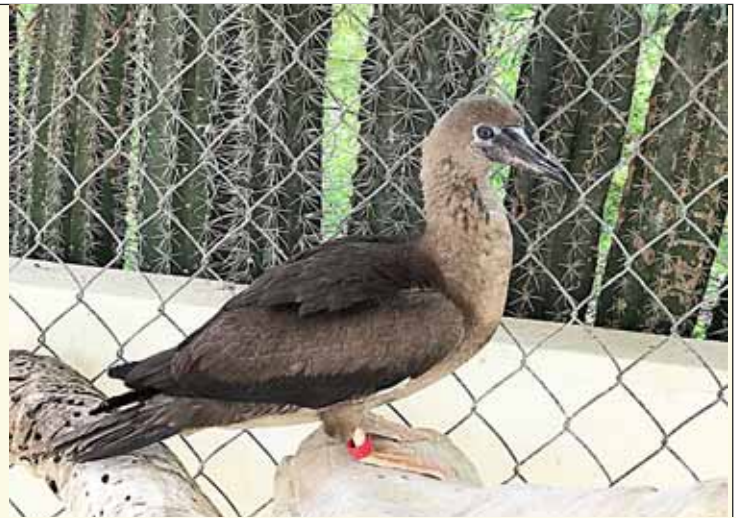
Brown Booby

Naturally, a bird's feathers overlap each other to create a waterproof cover. Millions of tiny barbs on individual feathers gently interlock with each other to create a flexible seal. Oil breaks this seal, because it separates these tiny barbs, resulting in skin becoming exposed to the water and impairing the bird's buoyancy and flying ability. Instinctively, the bird will try to get the oil off with its beak, poten-