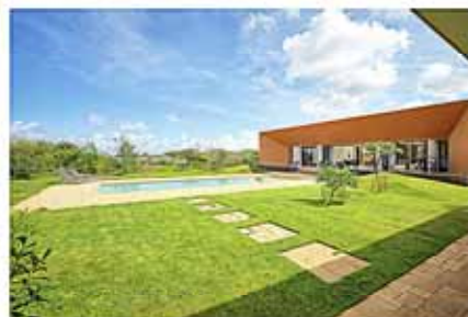
Tra 'i Montana 45, Eco Estate US$985,000 🛏️3 🏠4.5