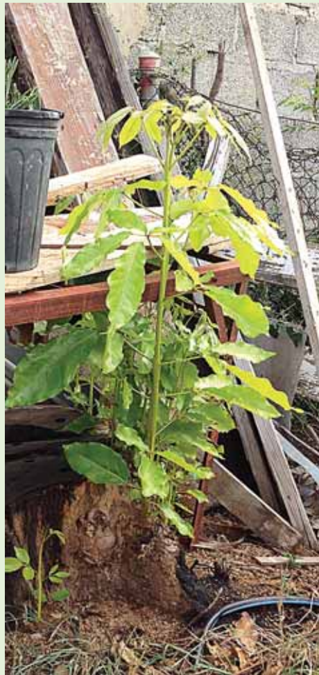
The stubborn tree

Turn the leaves over with your hands once a day so they all get fresh air, otherwise the under leaves sweat and get rotten. After a week, the leaves will be nice dry and crunchy. Use the Moringa tea within two months.