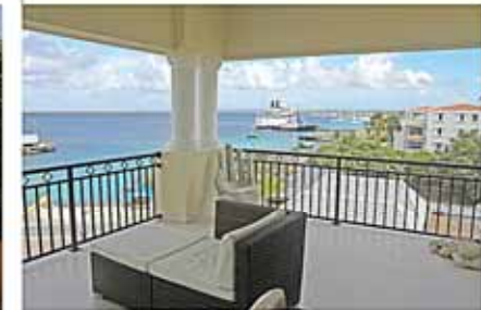
Kralendijk, Hausmann Follies 13 US$845,000 🛏️3 🏠3.5