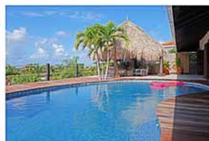
Sabadeco, Crown Villas 18 US$649,000 🛏️3 🏠3.5