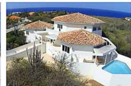
Sabadeco, Crown Shores 69 US$1,115,000 🛏️4 🏠4