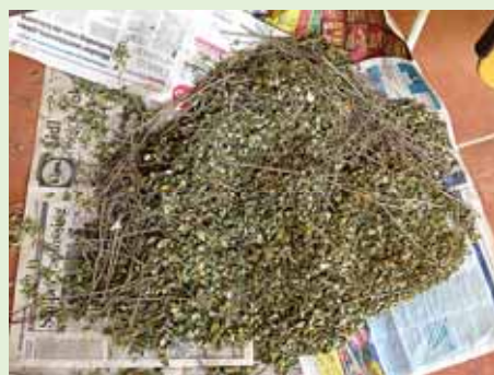
Dried Moringa leaves

It's good to have your garden ready now for young plants with compost and manure. Even when it's so dry with just a little rain I start to put veggie seeds in pots to get young plants. Within a short time they will be big enough for the prepared soil in my garden.