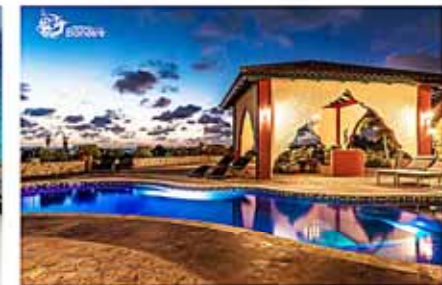
Sabadeco, Crown Villas 20/21 US$895,000 🛏️4 🏠4.5