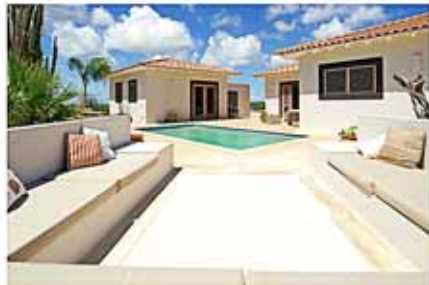
Bona Bista A36 US$525,000 🛏️4 🏠3