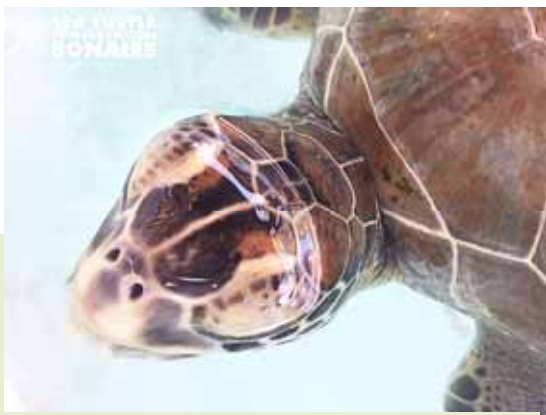
Rosita surfacing after a dive

THE SUCCESSFUL REHABILITATION OF A JUVENILE GREEN SEA TURTLE 'ROSITA'