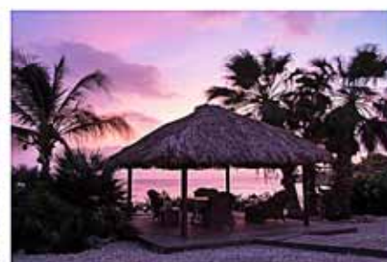
Stunning Oceanfront Villa US$1,950,000 🛏️5 🏠4