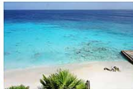
Belnem, Bellevue Apartment 8 US$579,000 🛏️2 🏠2