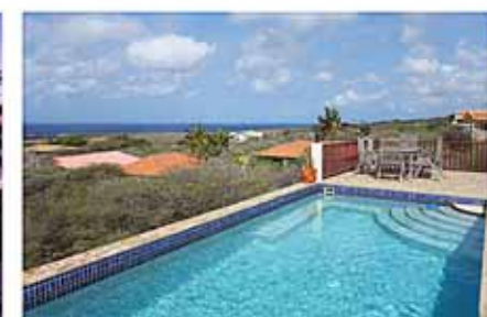
Santa Barbara, Kaya Safiro 3 US$575,000 🛏️6 🏠2.5