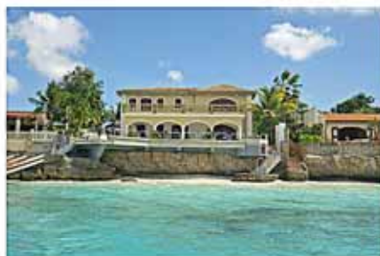
Belnem, E.E.G. Boulevard 42A US$2,200,000 🛏️5 🏠5