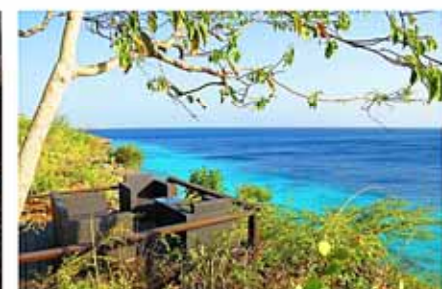
El Pueblo 12 US$895,000 🛏️3 🏠2

Office: Plasa Reina Juliana 6 Phone: +599 717 4686 info@caribbeanhomesbonaire.com www.caribbeanhomesbonaire.com