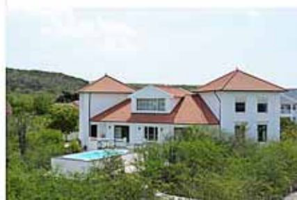
Sabadeco, Crown Shores 52 US$549,000 🛏️3 🏠3.5