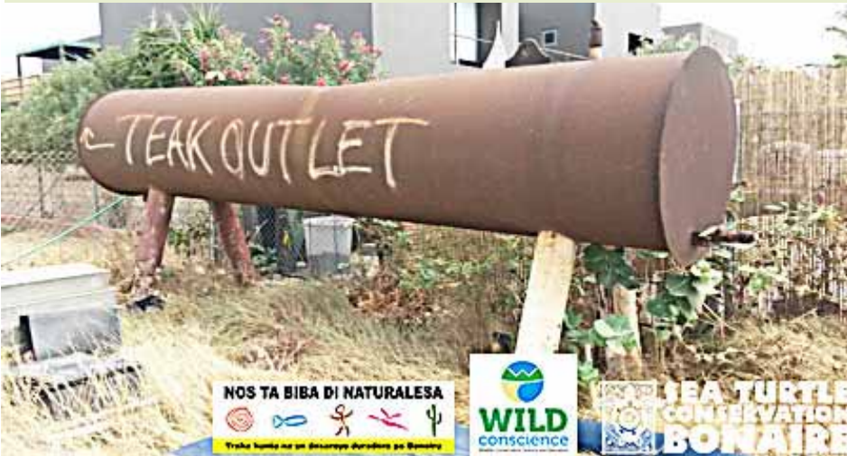
TEMPORARY IRRIGATION SYSTEM INSTALLED ON TE AMO BEACH

As part of the Beach Protection Project, Sea Turtle Conservation Bonaire (STCB) together with WILD CONSCIENCE BV and the Bonaire Island government is setting up a temporary irrigation system to irrigate the 50 green buttonwood trees (a native species of mangrove) that were planted on Te Amo Beach in January 2017.