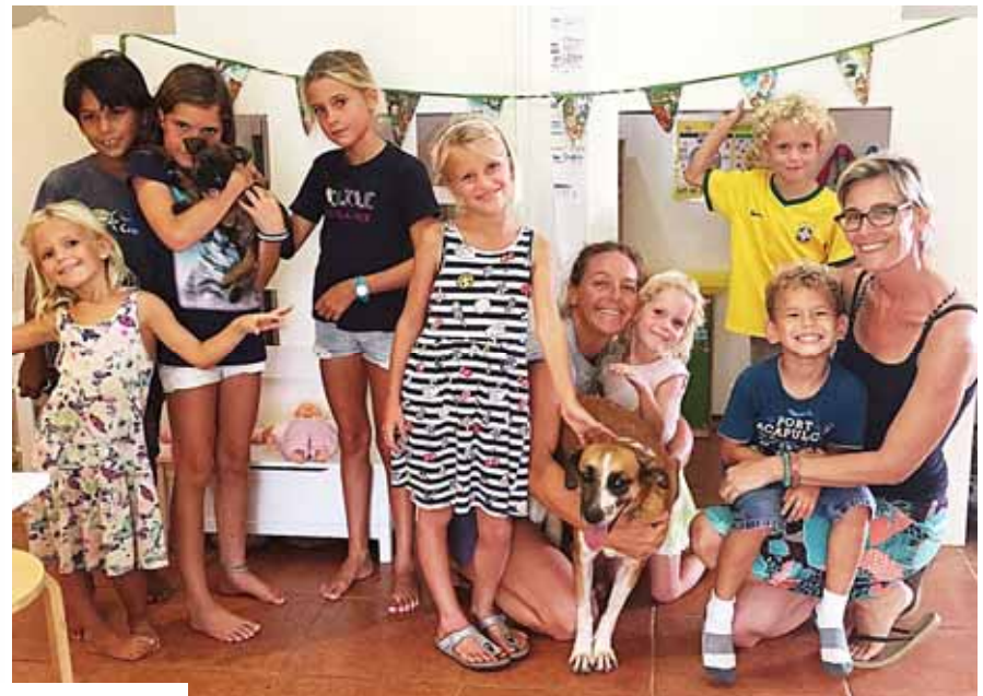
Fun at BOKS