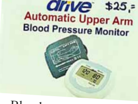
Blood pressure monitors