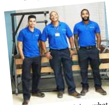
Our team servicing what we rent and sell

Opening Hours: 7:30-17:30 Non-Stop Kaya Jean B. Vitté 3 Kralendijk Bonaire Caribisch Nederland Tel: (599) 717-5543 Fax: (599) 717-5724 info@bestcarelogistics.org