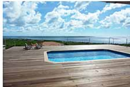
Sabadeco, Crown Terrace 32 US$549,000 🛏️3 🏠3