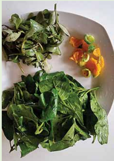
Today's veggy mix: Bimbe with bitter melon and bitawiri ( Surinam name which means bitter leaves)

So I picked some of them and made a mixed veggy dish for today. I tell you what. I have eaten in the best restaurants all over the world and enjoyed it, but my own veggies, fresh from the garden, nothing can beat that. There is such a difference between vegetables that are just picked and straight into the pot and vegetables that are old and on their way out. The difference is in the taste and also in color, crunchiness and moisture. In the photo you can see my veggy mix of today. Bimbe with bitter