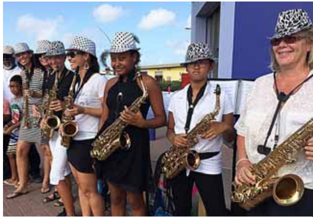
Saxomaia at Van der Tweel market

Saxomaia, a new group of enthusiastic saxophone players gave a fundraising concert last Saturday at Van der Tweel market. The aim is to raise money to buy instruments for those who want to learn to play. The group is amazing as there are all levels of expertise and they sound like they've been playing for years together.