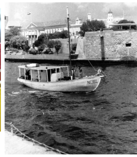
After being converted to a motor boat the Stormvogel powers out of Curacao.

Old Sailors Speak also provides the core of a new educational curriculum, Sails in the Schools , developed by the Bonaire