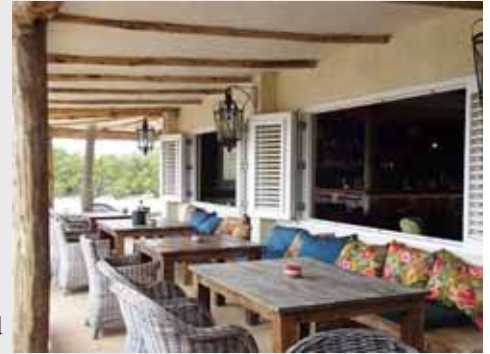
The new Foodies

And the revolving door of restaurants on Bonaire continues.... "Foodies Bayside Bar and Restaurant" is the latest reincarnation of the site of the former Kon Tiki and Lac Bai restaurants. The new owners spent five weeks of rebuilding and decorating and the result is fabulous. Foodies opened last week for lunch and dinner (with coffee being served from 10 am) and will have a "birth" celebration on July 8 starting at 5 pm. Lunch menu is offered from noon til 5 pm and dinner menu from 6 to 9 pm. They also offer a menu that is served from noon until closing. You can check out their menus on their Facebook page "Foodies."