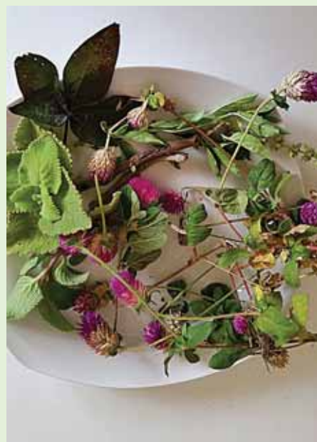
Herbs to make fresh green tea

Tell the caretaker what to do with fruits and veggies that are ready to eat: