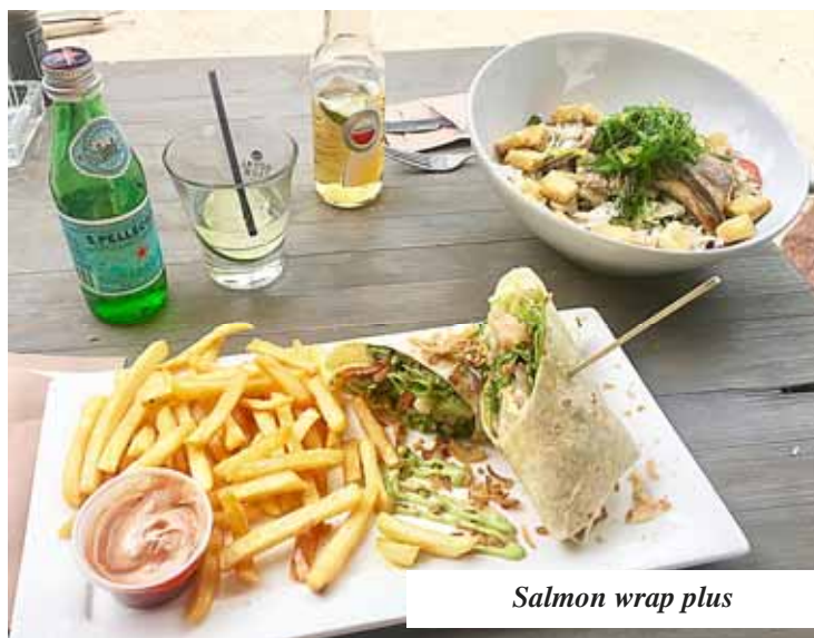
Salmon wrap plus