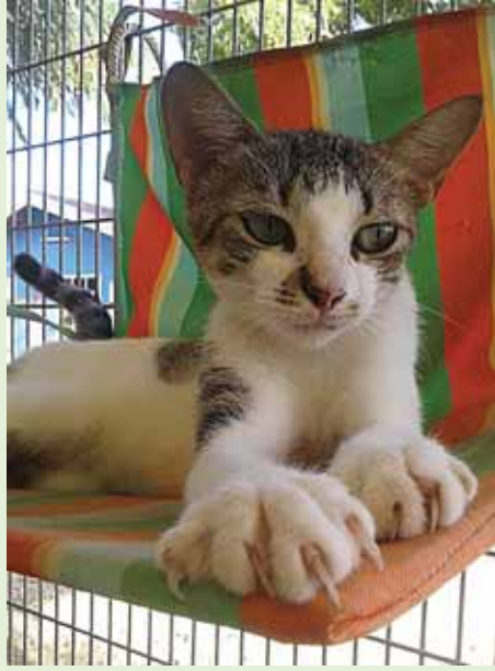
Lola at rest

Lovely Lola is another example of feline "art work." She is primarily white with tabby tail and head markings. This basic "palette" is randomly accented with large tabby "polka dots" creating a beautiful piece of living art. Lola is a one-year-old, medium sized cat that has a perpetual kitten look. She has a sweet and affectionate personality and a fondness for playing with toys....maintaining that "kitten" demeanor. She also loves to "scoop" her water into a curled paw and lap up a quick bit of refreshment. Lola is healthy, vaccinated and sterilized and would grace any home and heart with beauty and affection. She gets along fine with other cats, but also is content with only human company. You can visit Lola and all her Shelter companions at Animal Shelter Bonaire, Kaminda Lagun 26. Opening hours Tuesday through Friday, 9 am - 12 pm and 3- 5 pm, Saturdays 8 am- 3 pm non-stop.