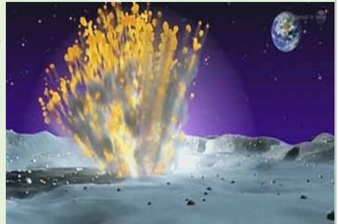
When a meteor hits the moon— fireworks!

There are two planets out there as well. Giant Jupiter is in the southwest, looking like a suspiciously-bright, cream-colored star... and the ringed planet Saturn is in the south-southeast. It doesn't stand out as much as Jupiter,