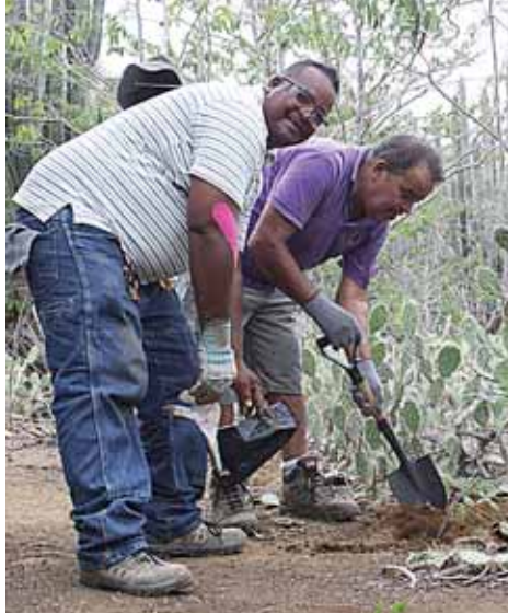
Tree planting in Washington Slagbaai Park last year

Because Bonaire is hot, dry and rocky, the natural development of plants is often slow. Reforestation projects can help nature in nature. More trees mean that the roots can hold the ground better when there are heavy rain showers. A fertile soil builds up leaf waste and allows the soil to absorb more water, which makes the trees