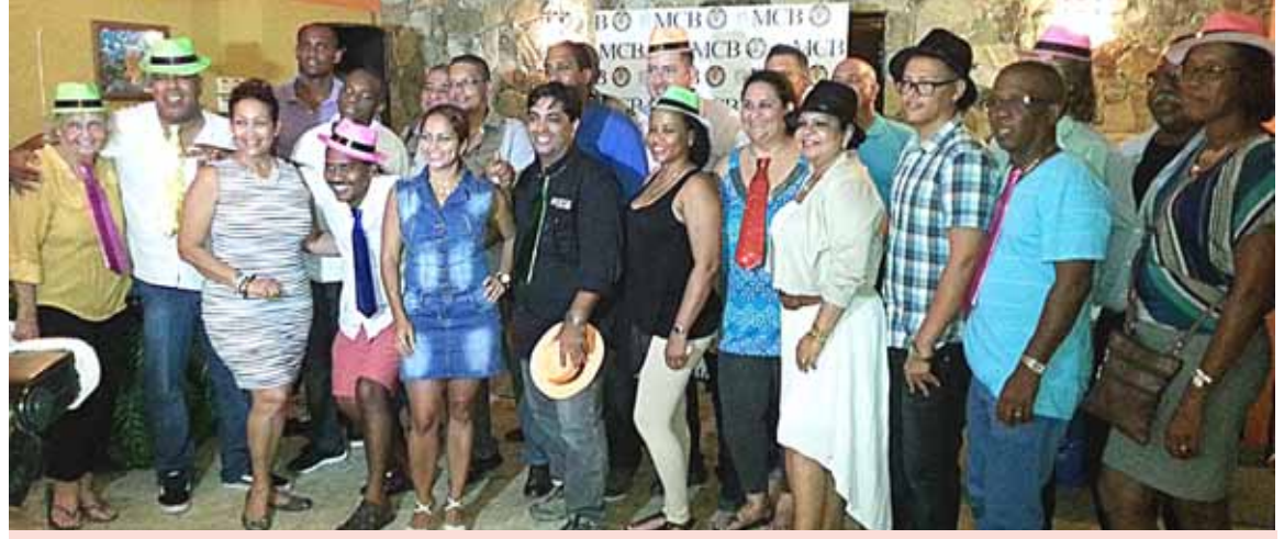
Members of Bonaire's broadcast and print media at MCB's Mysteries Of Kralendijk press party