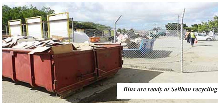
Bins are ready at Selibon recycling

The mission of this event is to increase awareness of Bonaire people regarding the problem of litter and rubbish and that it is not only Selibon's responsibility to keep our Island clean but it is also the responsibility of each person as well. The cleanliness of Bonaire is often a top reason visitors say they prefer Bonaire over other places in the Caribbean. Groups and individuals may sign up with Selibon. Tel. 717-8153. ■ G.D.