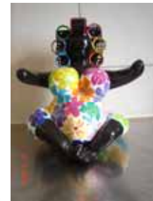
A Chi-Chi Doll