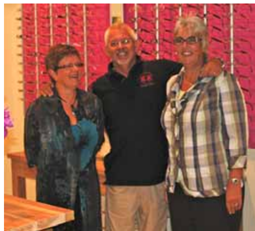
Kaya Grandi 32B, down a bit in the alley in between Best Pearls and Gio's Ice Parlor Phone: 717-9181

Is Bonaire changing from shipping to aviation? ■ Story & photos by Jacinto Frans