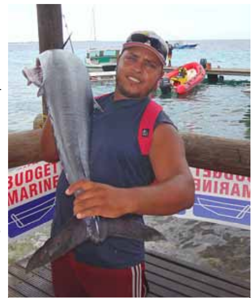
Double Eagle landed 2014's biggest fish

Best yet, there will be the Boat Party in the afternoon, so you can immediately tie up and begin to party! Boats arriving from Curacao and Aruba are welcome to fish along the way, so long as they reach the dock by the deadline. You must clear customs and immigrations before reporting to the weigh station. Please sign up in advance at the Budget Marine store on your island or via email to bonaire@budgetmarine.com