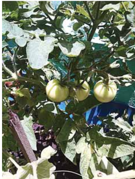
Cherry tomatoes ripening on Bonaire

The tomato is a berry fruit which belongs to the nightshade family Solanaceae and is called Lycopersicon . While it's botanically a berry fruit, it's considered a vegetable for culinary purposes. The species originated in the South American Andes, was later used as food in Mexico in 500 BC and spread later throughout the world. The leaves are in fact poisonous, although the fruit is not. Originally the tomato was yellow, but this changed after discovery of a mutant "U" phenotype in the mid 20th century that caused it to ripen uniformly. Prior to that most tomatoes produced more sugar during ripening and were sweeter and more flavorful.