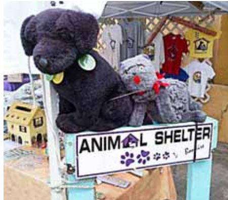
Cruise Market Sales

Large variation of souvenirs, like driftwood signs, T-shirts, handmade collars, stuffed animals, etc. are sold to help gener-