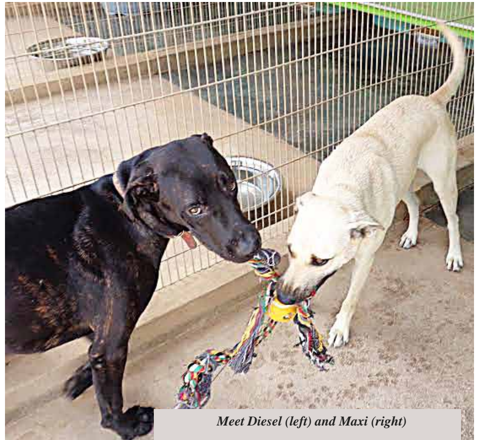
Meet Diesel (left) and Maxi (right)

Hi guys, I am Diesel. I was rescued by a nice cop and the Bonaire Animal Shelter team. I am almost a year old and I am very happy, I like to play and I'm looking for a cool family who likes to love and take care of me. They say I am a very handsome black Labrador mix. Well, I think they are right because last week I got a new girlfriend and she loves me!