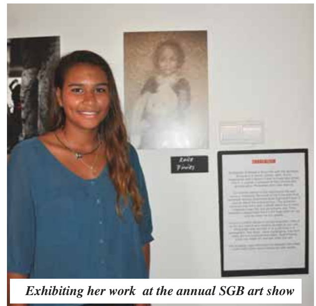
Exhibiting her work at the annual SGB art show