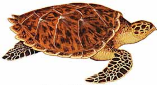
Hawksbill Sea Turtle

It turns out that they are a perfect vehicle for companies wishing to do good and to be seen as doing good. Businesses that take their community citizenship seriously are discovering that it pays to share that commitment with their customers. A 2011 global study of consumers found that 81% of consumers want companies to address key social and environmental issues, and 94% will even switch brands to busi-