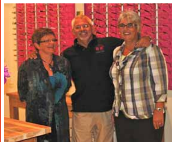
Kaya Grandi 32B, down a bit in the alley in between Best Pearls and Gio's Ice Parlor