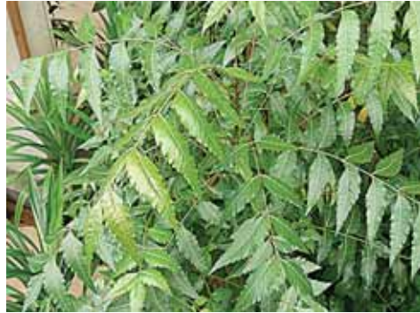
Neem tree leaves

Neem is also a vegetable. The tender shoots and flowers are eaten in various