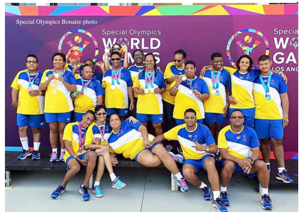
Bonaire 2015 Special Olympics team and coaches