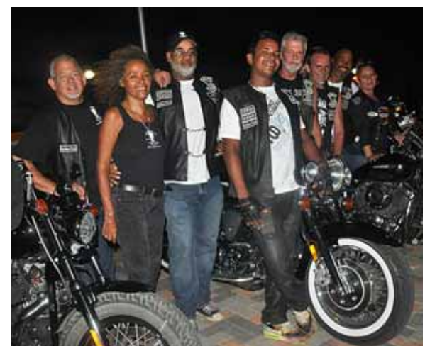
← The Iron Order Motorcycle Club provided an escort for the Warriors to their lodgings at Divi Flamingo and Captain Don's Habitat.