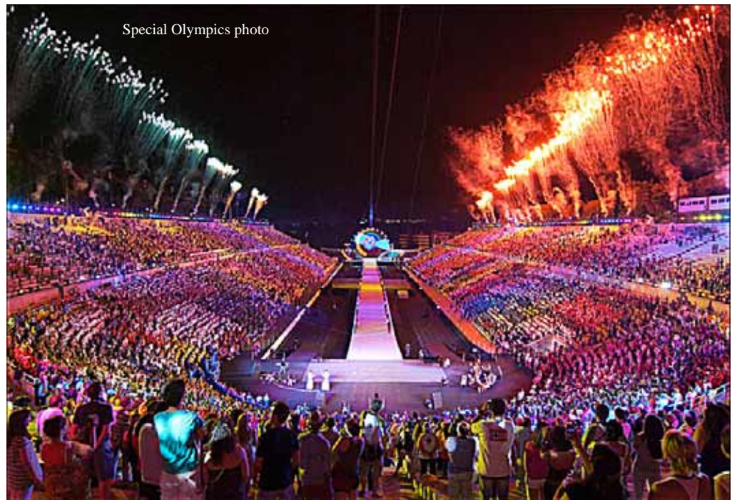
Special Olympics photo 2015 Special Olympics Opening Ceremony in the Los Angeles Memorial Coliseum