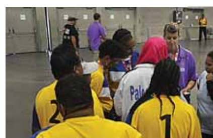
Bad news. After an apparent Bocce win the officials admit to a scoring error.