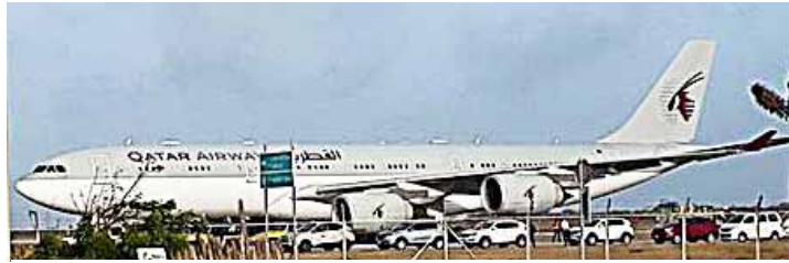
This Airbus 340 was parked at Flamingo airport while its owner, a Middle East sheik was enjoying Bonaire's fishing and diving from three large power boats rafted at the town pier.

► As announced, the tax service closed its cash registers as of 1 May 2015. As of that day it was no longer possible to make payments at the tax office on Bonaire. All payments are to be made at a bank or on-line. However, it is trying to make the transition to bank payments as smooth as possible by making space available for local banks in the tax office to assist persons in paying their fees. Two banks (MCB and RBC) have helped taxpayers on several days by providing information about the most obvious and/or most