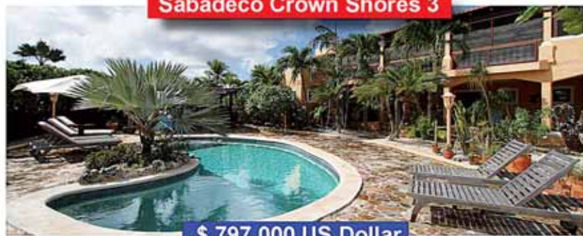
Sabadeco Crown Shores 3