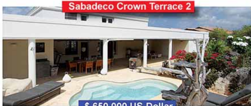
Sabadeco Crown Terrace 2

Located in Sabadeco • Lot size: 3572m2 • Owned land Living area: 360m2 • Adjacent building lot of 3457m2 Wheelchair friendly • Elevator • Pool