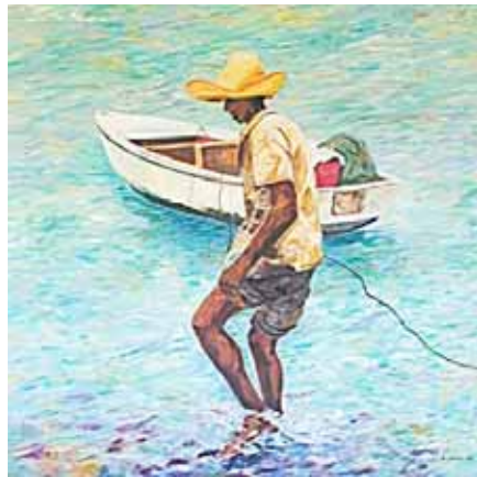
" Bonaire fisherman standing in ankle deep water in front of his local fishing boat—he fished out of Playa Pabou until recently"