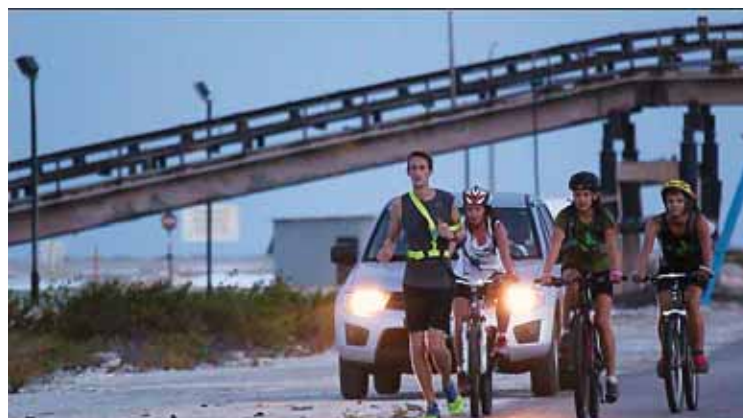
The final push... as darkness falls

The miles wore on with intermittent relief provided by cold ice water, the chat of my friends, sometimes being sung to, and wondering where the film crew would be next (at times in the sea, behind rocks, on the road, up high on vantage points)! With my stomach hurting and not being able to breathe well it was a serious struggle. I continued along reaching the salt pans at mile 20 where the real problems started to kick in - my stomach ache was excruciating and my legs started to cramp. Prior to this I had been training in the cool hills of Jamaica for three months, so the weather and flat surfaces were a shock.