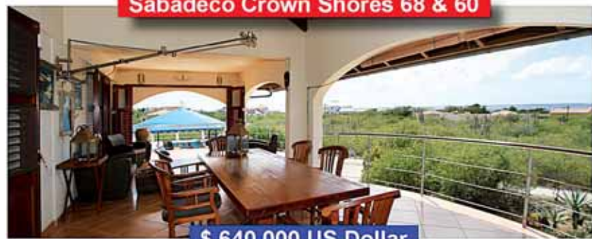
Sabadeco Crown Shores 68 & 60

Located in Sabadeco • Lot size: 2119m2 • Owned land Living area: 620m2 • 4 bedrooms / 5 bathrooms Ocean access • Sweeping ocean views