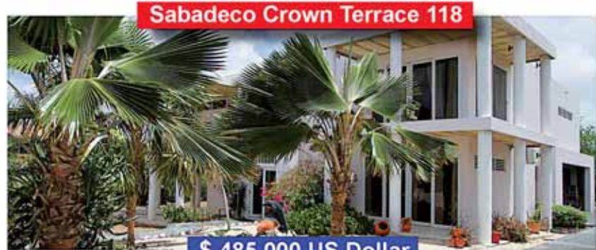
Sabadeco Crown Terrace 118

Located in Sabadeco • Lot size: 1607m2 • Owned land Living area: 578m2 • 5 bedrooms / 5 bathrooms Separate apartment • Great ocean views