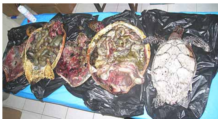
Cadavers of the slaughtered turtles (above)

On Monday morning (23rd March) a plastic garbage sack was spotted by the side of the road, close to where James Abraham Boulevard meets Kaya International. On investigation three dead sea turtles were found inside. Two were juvenile critically endangered hawksbills, both of which had identification tags from Sea Turtle Conservation Bonaire (STCB) and one was a juvenile endangered green turtle. Two had been butchered. As two of the turtles had been tagged on the south east side of Klein Bonaire in 2010 and 2014 STCB thinks that it is likely that the turtles were caught there on Sunday evening or Monday morning.