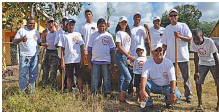
During BonDoet recently a large group from Special Security Services (SSS) volunteered to clean the terrain of SEDE Scouting Bonaire. In the last issue of The Reporter on page 11, the caption was missing.

Every year the Orange Fund rewards social initiatives which connect people in a successful way. Participation is open to all