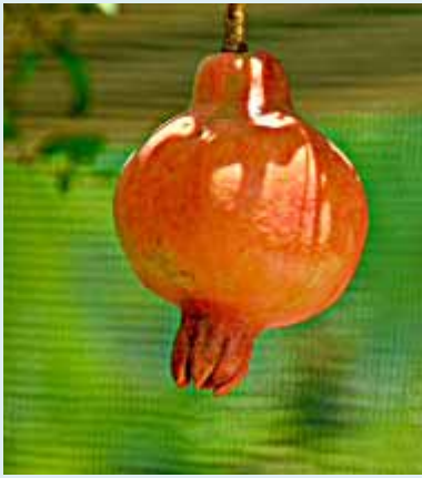
A rosy pomegranate ready to pick.

It's amazing how much fruit the trees are bearing after the rainy season.