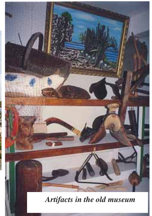
Artifacts in the old museum

The attached photo is of the restored Kas di Arte building. It is beautiful but