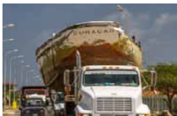
By freighter and truck Stormvogel returned

On the morning of March 25 th , local freighter Doña Luisa became visible as she rounded the far tip of Klein Bonaire. It was just another freight run for the workhorse ship, but on this sunny day something looked different. While her deck was jammed with the usual freight containers, placed on her port side was an impressive 45-foot wooden hull. Stormvogel was finally coming home.