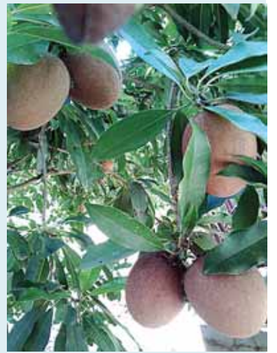
Egg shaped mispel. They come in a round shape as well.

Oh, by the way, the Loras (local parrots) are crazy about this fruit. So to be able to enjoy your mispel look for small paper bags like the brown ones or