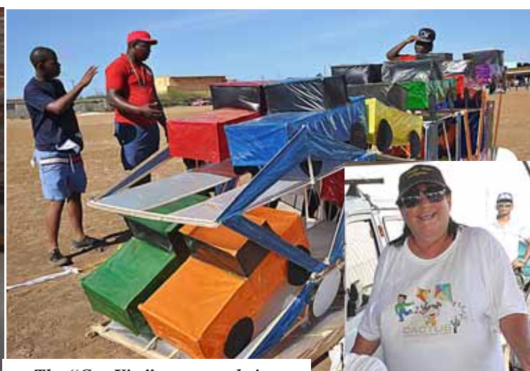
The "Car Kite" never made it too high but was quite fantastic