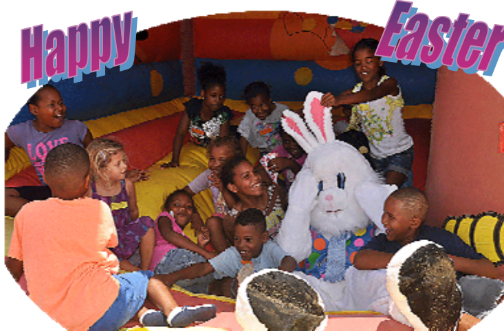
The Easter season was celebrated on Bonaire with gusto. There was lots of camping, special meals of ham (Americans) and fish (Bonaireans) and Easter Sunday brunches (Dutch). For kids there were Easter egg hunts and fun days like the one at Amboina sponsored by FESBO. (above).

A former Bonaire police officer brought a laser gun recently and other officers are being trained to use it. In a test, the speed of the approaching vehicles was measured and