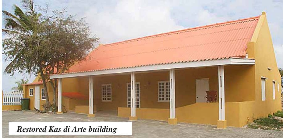
Restored Kas di Arte building

At the present time there is not enough room to use most of what is in the container in the museum, so the thought is to give or loan parts of the collection to