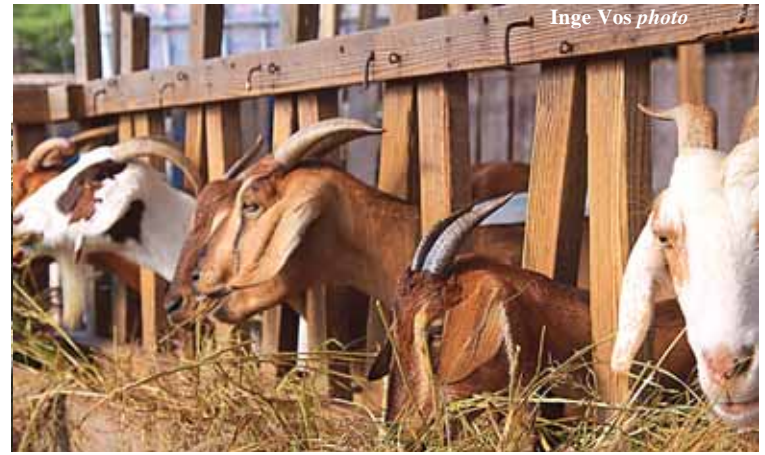
Mama goats lined up to be milked