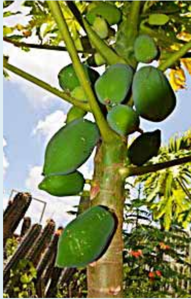
The ever-popular papaya

The fruit has a high latex content and does not ripen until picked. The fruit has an exceptionally sweet flavor. It's eaten