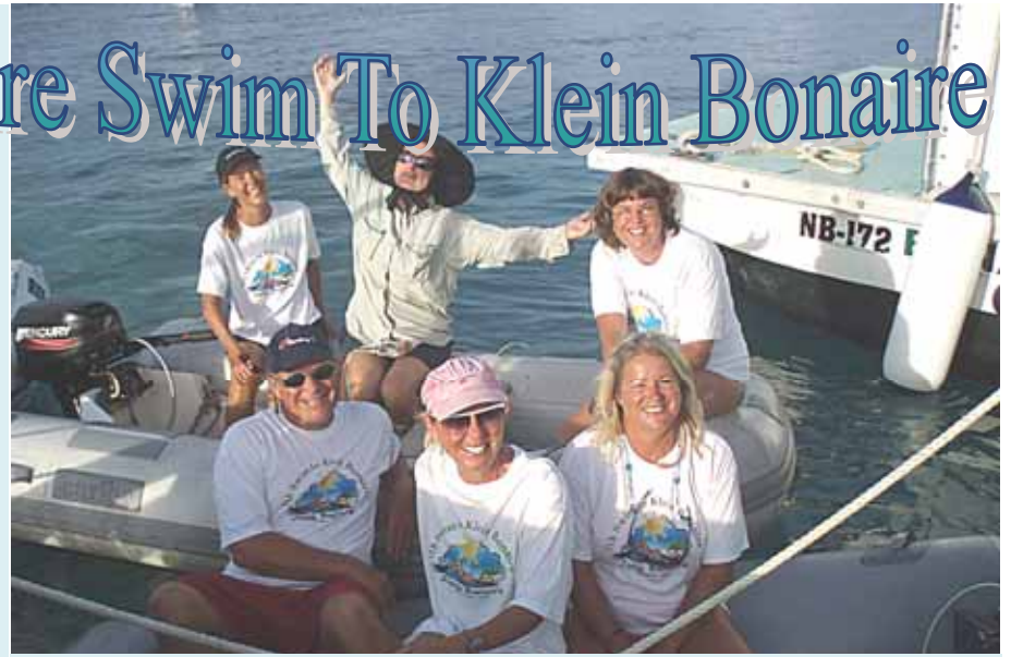
Visiting yachtswomen and a yachtsman performed safety patrols in dinghies: Crews from yachts Wishful Thinking, Northwind and Heartsong III

Dozens of individual volunteers and companies added their sponsorship to make the event a huge success. □ G.D.