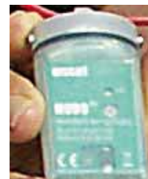
An LSMP sensor

The "Rainbow Sensor" arrays, consisting of 3 sensors each at depths of 5, 12 and 20 meters, are being placed at various intervals along the coast on independent underwater mooring lines. The sensors use advanced optics and temperature to monitor the seawater. Readings are continuously recorded every 8 minutes by each sensor. To keep costs manageable, a volunteer diver must visit each array every 7 days for cleaning and data retrieval. To date, all arrays are being serviced by volunteers. All the money for the hardware was donated by concerned individuals.