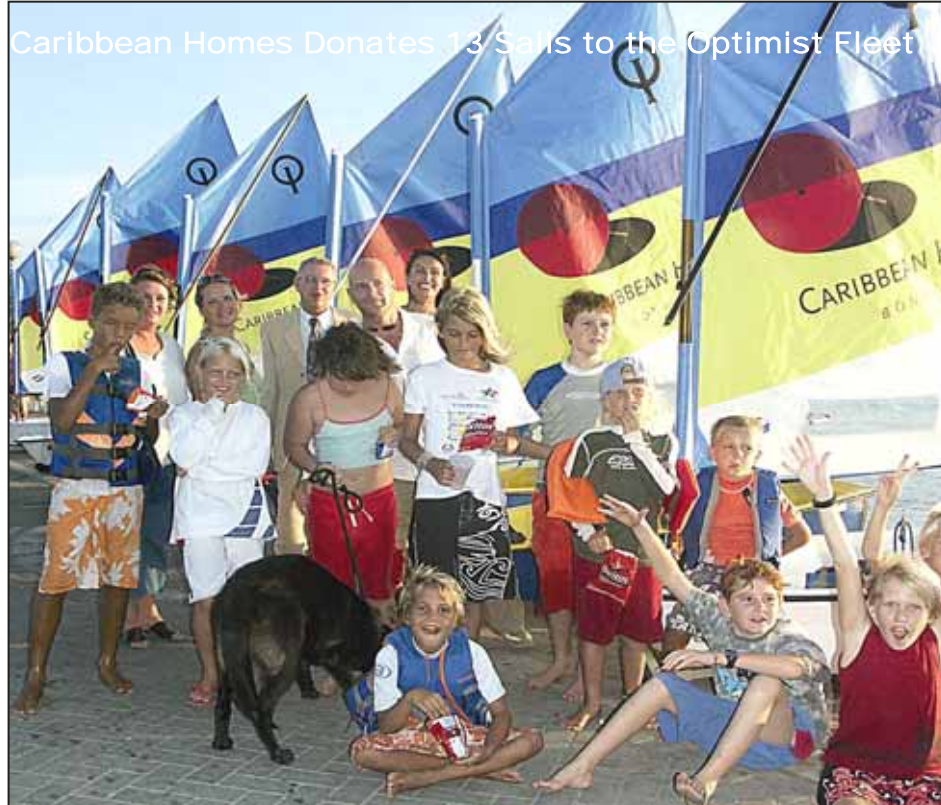
Caribbean Homes Donates 13 Sails to the Optimist Fleet