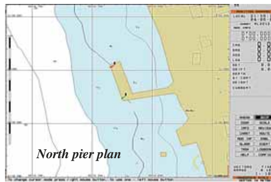
North pier plan