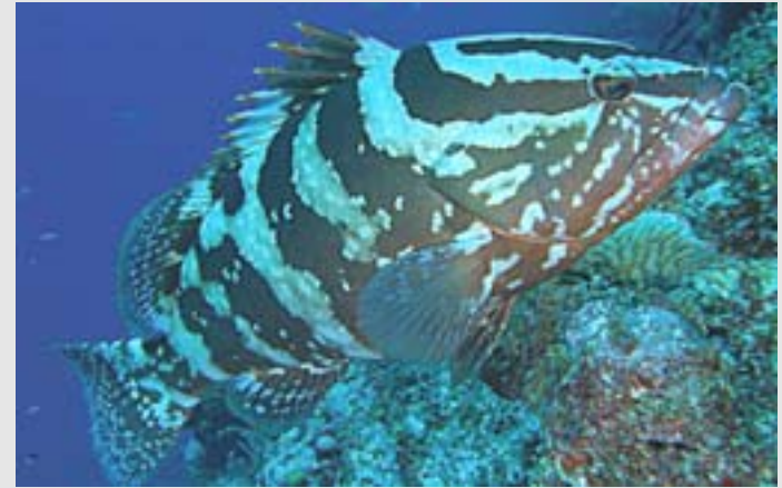
Nassau Grouper

Groupers, in particular, are at risk in part because of their reproductive strategy. They migrate for many miles to reach their spawning grounds once or twice a year. The group then mass spawns over a period of a few days and their fertilized eggs subsequently drift with the ocean currents, develop into small larvae, and settle to the bottom (sometimes this development stage takes months). Once fishers realize where and when the groupers