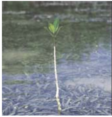
Mangrove seedling

The area, close to Lac Bay, is protected by the Ramsar Treaty which mandates maintaining its ecology and natural resources. According to Ramsar Treaty