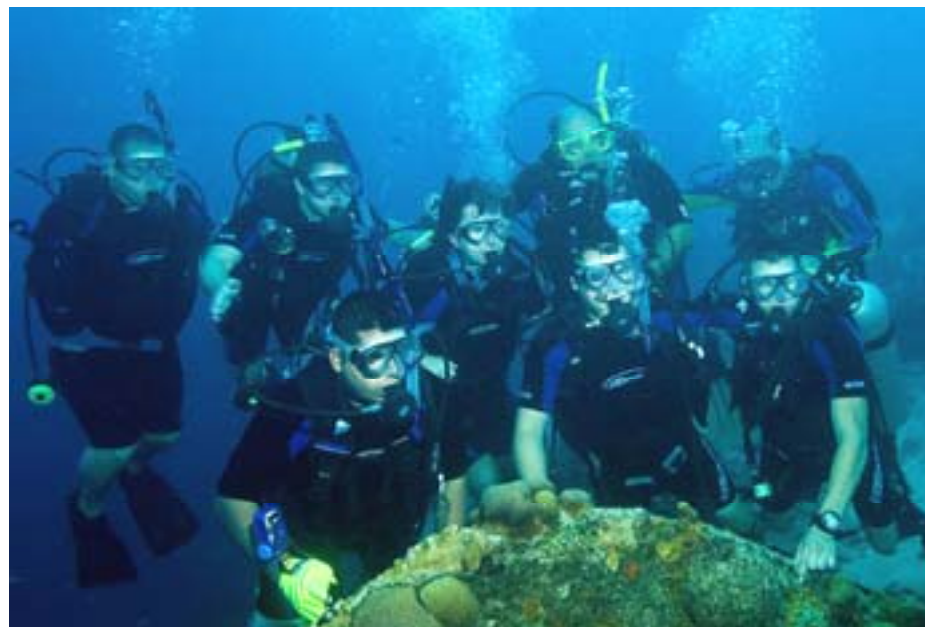
The full complement of the Diving Warriors—not all could make it to Bonaire.