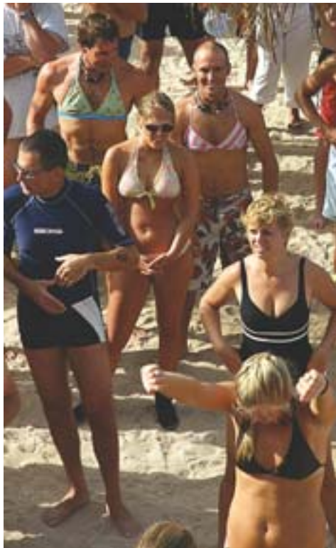
What's wrong with this picture?