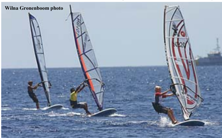
The future of Bonaire—Young Freestylers