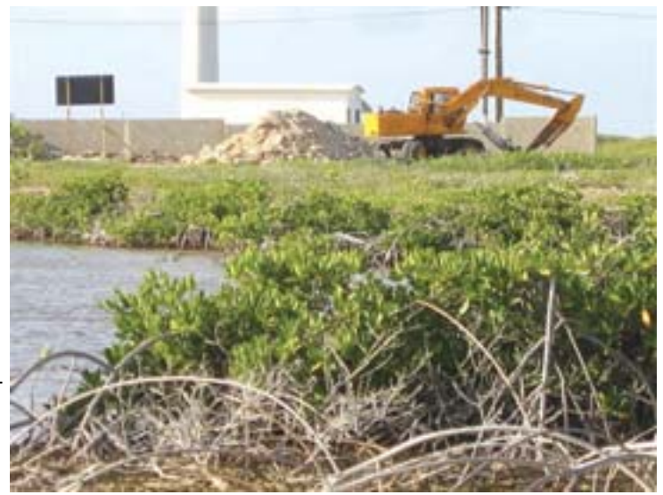
Work had already begun at Mangrove Village.

Based on the Netherlands Antilles Islands Regulation (ERNA), the Governor, as representative of the Kingdom, can suspend or annul a decision taken by one