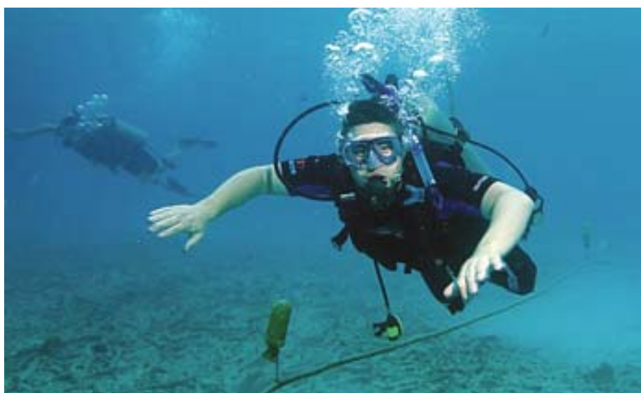
Following the line brings a smile