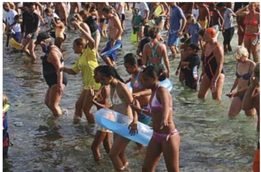
Watch the first step!