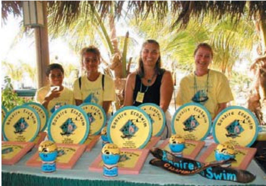
Awards ceremony from a previous Eco-Swim

The 6th Annual Bonaire EcoSwim is this weekend, Saturday, October 21.