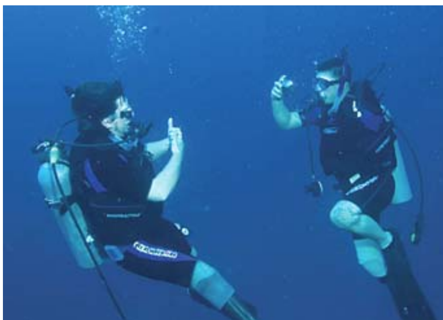
Learning underwater signals