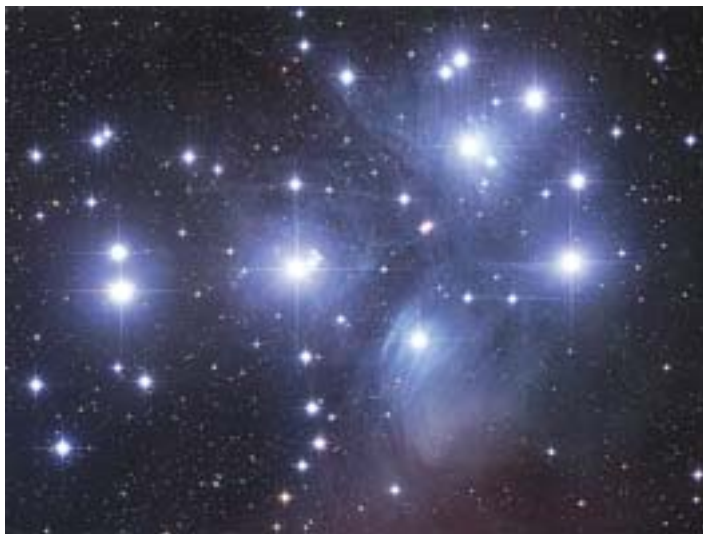
Pleiades, the Seven Sisters

Y ou know, because Halloween greeting cards often depict a witch riding a broom in front of a full moon that many people have the mistaken notion that there's a full moon every Halloween when in fact we won't have a full Moon on Halloween again until 2020. But there is something you can see in the night sky every Halloween that has long been associated with traditional days of the dead.