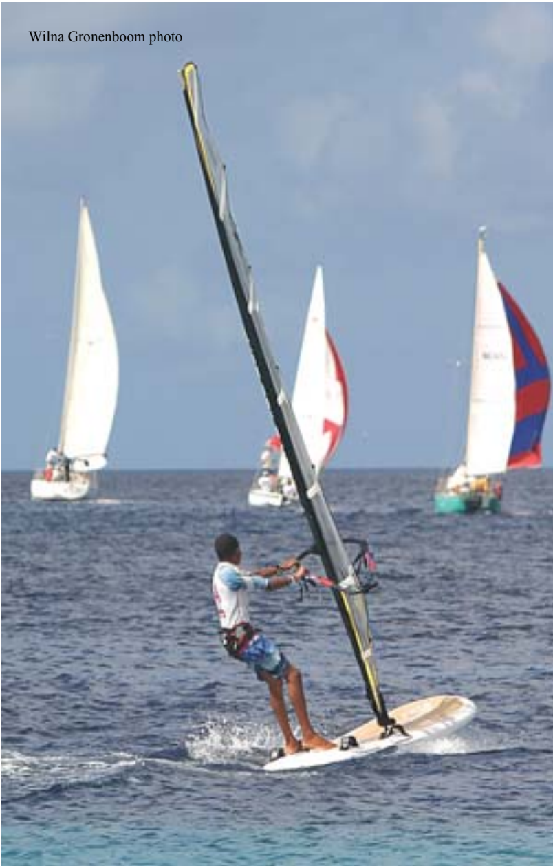
Windsurfers to yachts, the Regatta has it all