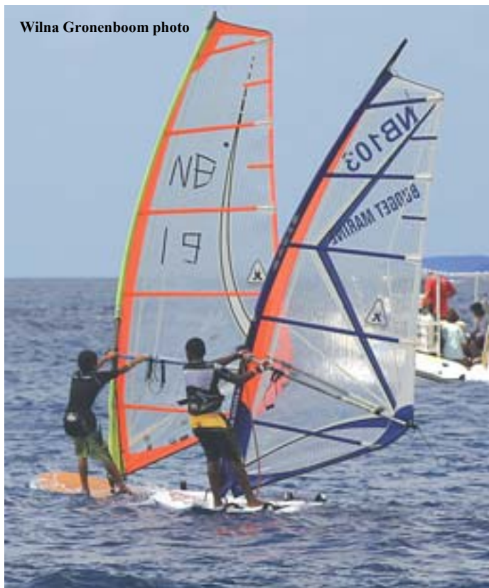
The wind was too light to beat the motorboats that day