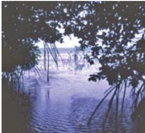
Mangrove Aerial Roots