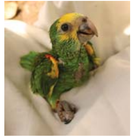
Almost ready to fly in the wild... unless he gets poached!