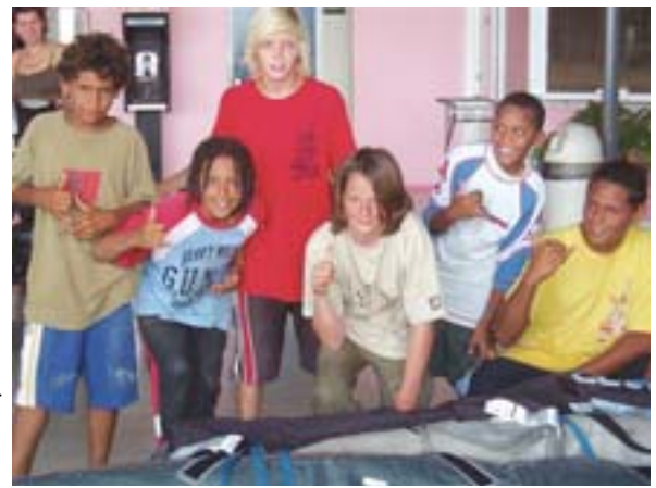
Bonaire kid's welcoming committee

10:00 - 12:00 Freestyle Competition 12:00 - 14:00 Lunch 14:00 - 18:00 Freestyle Competition 20:00 - 21:30 Bonaire Partners Ice Cream Party for competitors (location TBA)