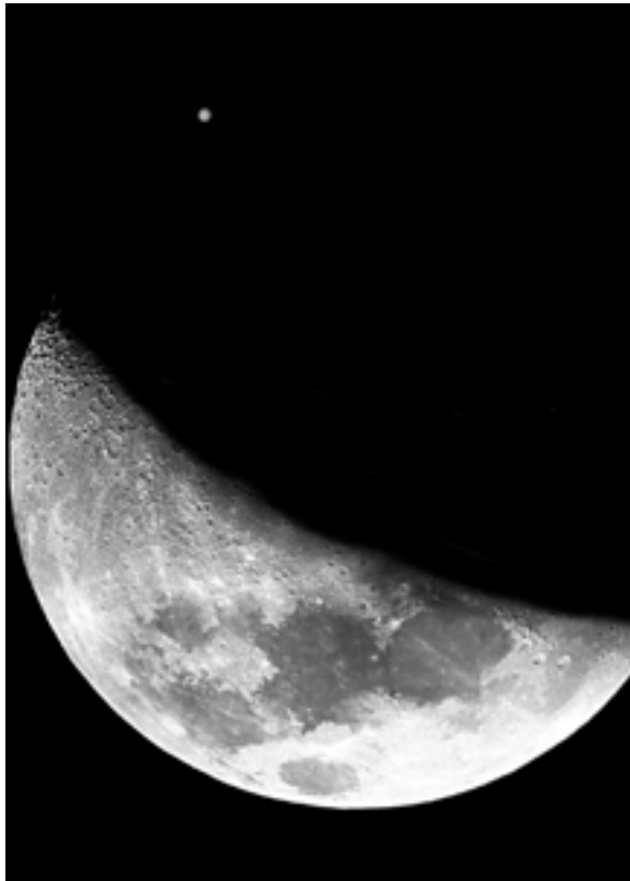
Jupiter over the quarter Moon

But now comes the fun part: comparing the Moon, Jupiter and Antares. You see, our 2,000-mile-wide Moon will be less than a quarter million miles away on the first four nights of August whereas 88,000-mile-wide Jupiter, which is so huge we could line up 44 Moons across its middle, will be 490 million miles away. But the mind blower is Antares, which is 700 times as wide as our almost one-million-mile-wide Sun and is so far away that it takes 604 years for its light to reach us. Isn't it easy to find planets and stars if you use the Moon as a finder? □ Jack Horkheimer