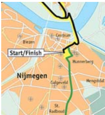
Following the completion of the first day's route the event was cancelled.