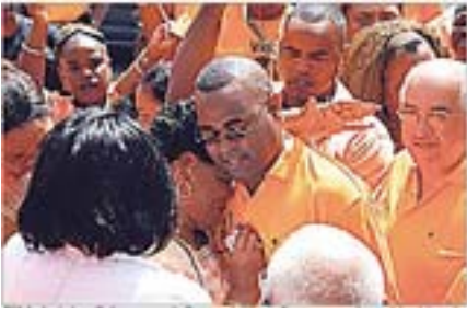
Godett and supporters extra photo

(Flotsam and Jetsam. Continued from page 8)