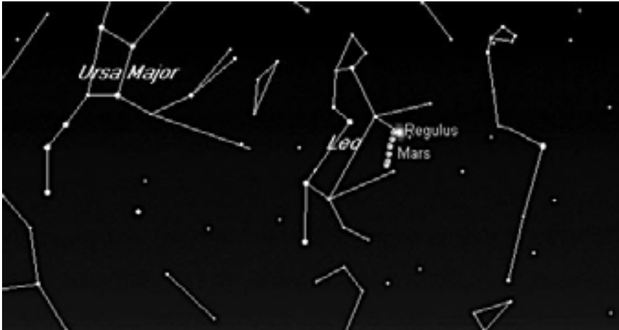
Mars and Regulus join up

The Red Planet Mars and the Blue Heart Star of Leo Pair Up This Weekend!