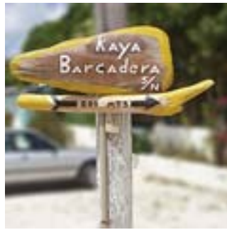
A better road sign

Outdoor signage and the proliferation of billboards on our roads clutter our