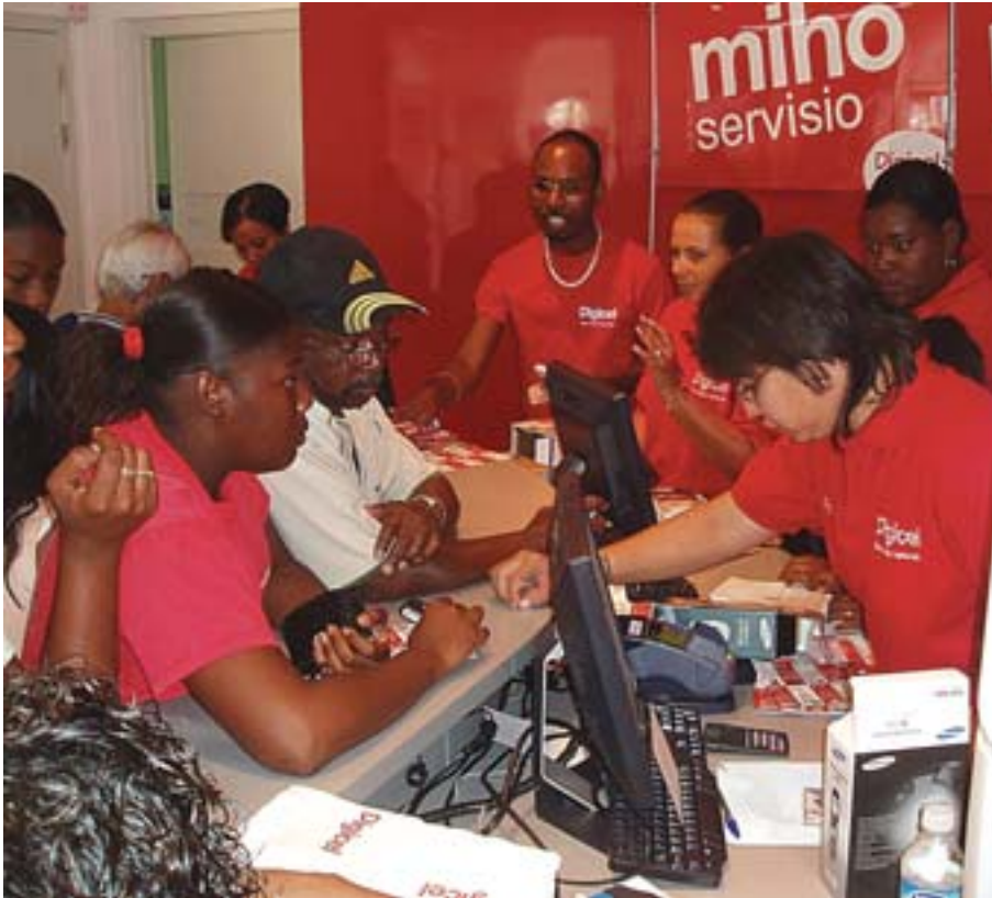
Action at the Digicel Office on opening day

D igicel, the fastest growing mobile phone company in the world, according to one of its top executives, began operations in Bonaire last Friday. It offers advanced cellular phone options that other cell phone operators promised but couldn't deliver. Eventually, it plans to have three retail stores and 110 top-up locations on the island. During its inaugural press con-