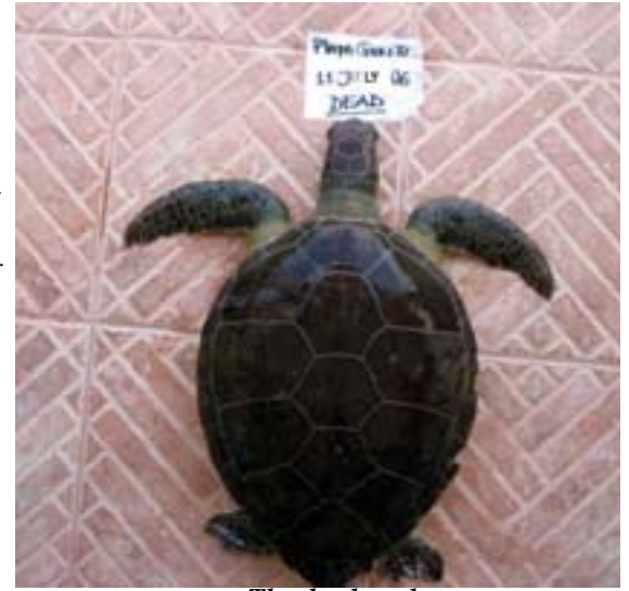
The dead turtle

Tourists visiting Washington Slagbaai National Park found a large fishing net on the shore at Playa Chikitu. Upon closer examination they discovered that two sea turtles were entangled in it. Unfortunately, one of the turtles was dead, but they managed to release the other unharmed. An earlier visitor to Playa Chikitu had informed the Park management about the net and Park rangers were already on route to the site. The dead animal was turned over to them and they in turn contacted Sea Turtle Conservation Bonaire.