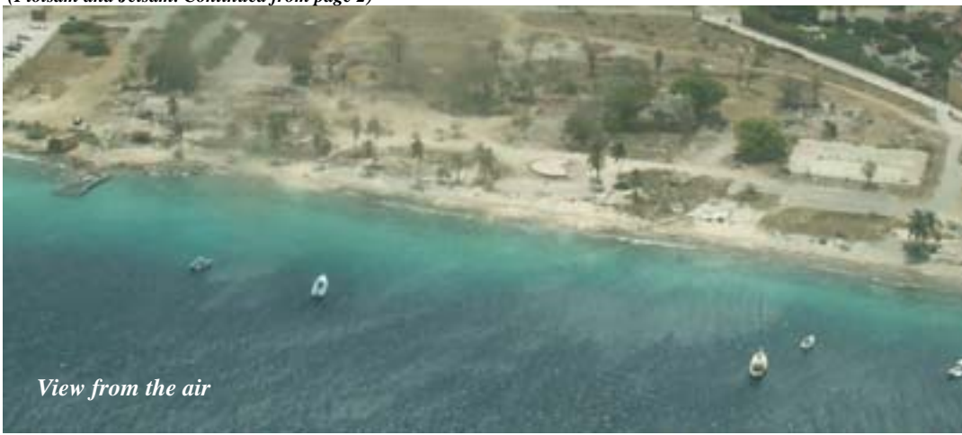
View from the air

(Flotsam and Jetsam. Continued from page 2)