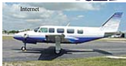
EZ Air will fly Piper Navajos

► Bonaire will soon have its own airline again. EZ Air expects to begin service before the October Bonaire Regatta, flying between Bonaire, Aruba and Curaçao as well as northern Venezuela. It will begin service with two 10-passenger Piper Navajo Chieftains and plans to acquire an 18-passenger Chinese-built Harbin. Airworthiness certificates have already