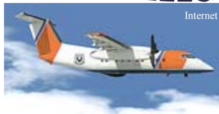
New long-range DHC-8s for the CG

The Ministry of Defense announced that two De Havilland DHC-8 aircraft will provide coast guard coverage in the Caribbean area beginning late 2007. A Canadian company, Provincial Airlines, will supply the airplanes and pilots. The Dutch Royal Navy and the Coast Guard will supply the tactical crew. The aircraft will also be available for emergency situations. The contract is valued at more than $100 million and is paid for from the budget of the Dutch Ministry of Home Affairs and Kingdom Relations. They will replace the present Fokker military aircraft.