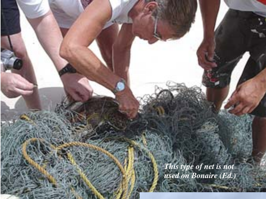
This type of net is not used on Bonaire (Ed.)