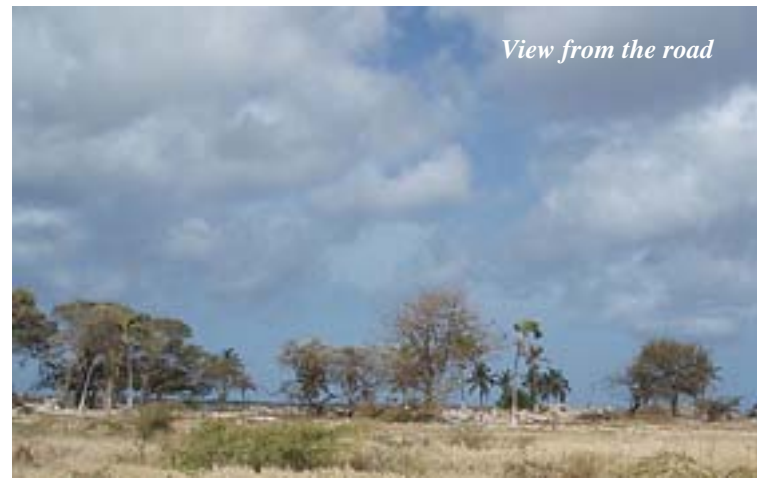
View from the road

►Enjoy these views of Sunset Beach that haven't been seen in 40 years. You can get a good view of the sea and Klein Bonaire from the road now that the rubble is being cleared. Soon a 250-room hotel (plus 60 condos) will be built here.