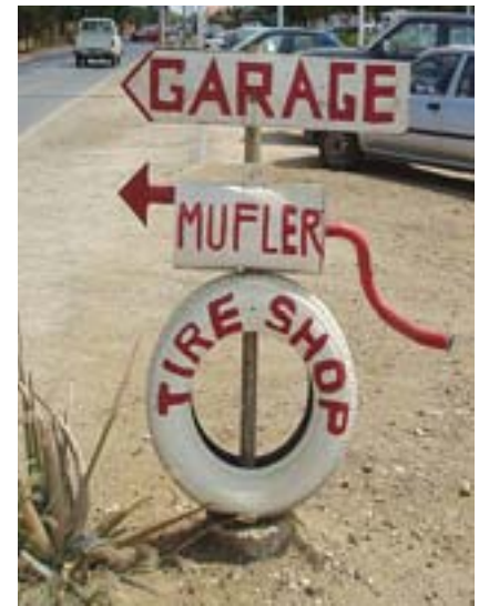
Better than a billboard?

"They detract from the beauty of our island." □ L.D.