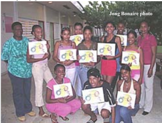
Jong Bonaire photo

► The Jong Bonaire Youth Center and Youthcare Bonaire reported that their first sexual education class was a success. The six-week-long course offered young people a variety of information on the subject and raised their awareness of the responsibilities involved in sexual activity. In the photo are the graduates from the 13- to 18-year-old group.