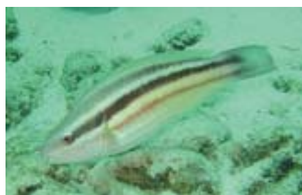
Princess parrotfish An initial phase parrotfish, probably the princess parrotfish -- which is distinguished from an initial phase striped parrotfish by dark borders on the base of the tail.

I wished I’d had my camera, then envisioned what would happen: the parrotfish would just keep on swimming. I thought about all my other interactions with parrotfish. Hmmm. There really weren’t any other interactions with parrotfish. Parrotfish don’t interact with divers, and they don’t interact with other marine creatures,