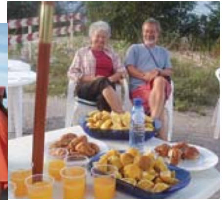
The MacDonald's stand at the start of the Tourist Road