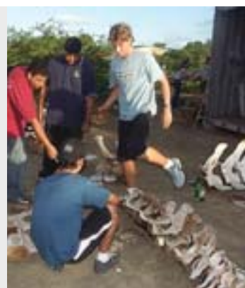
Bonai students cleaned and prepared the whale bones for display

But now the skeleton is in danger because it needs to have a roof over it to protect it from the elements it by November this year, according to Simal, but there are no funds to build it. You can help to preserve this fantastic work of so many by donating to Washington Park c/o MCB Bank, Stitching Stinapa Washington Park, Account #107-295-01, specifying “whale skeleton roof.” According to Park Manager Simal, your donations will go only towards constructing the protective roof. L.D.