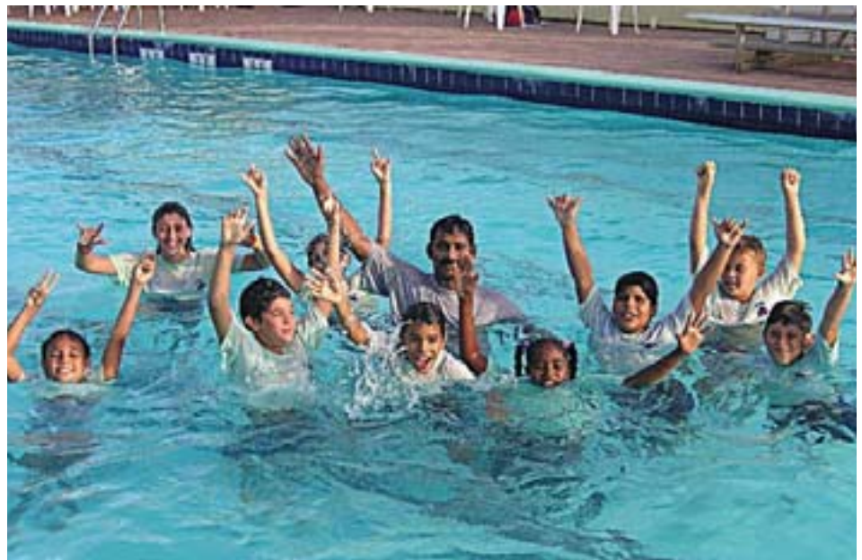
Papa Cornes Victory Cheer