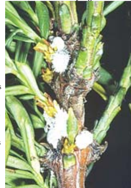
Mealybugs on a plant