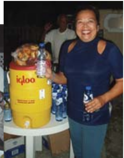
Norka's place at the entrance to Kralendijk