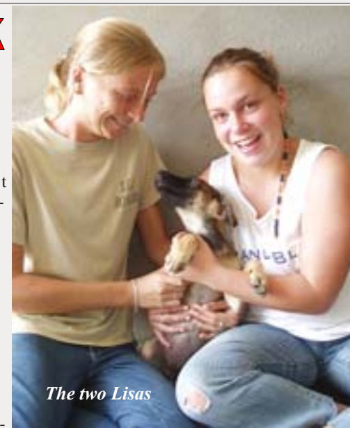
The two Lisas

A volunteer to do some gardening on the Shelter grounds would be very much appreciated right now. If you can spare some time, call the Shelter at 717-4989. You may choose your own hours. L.D.