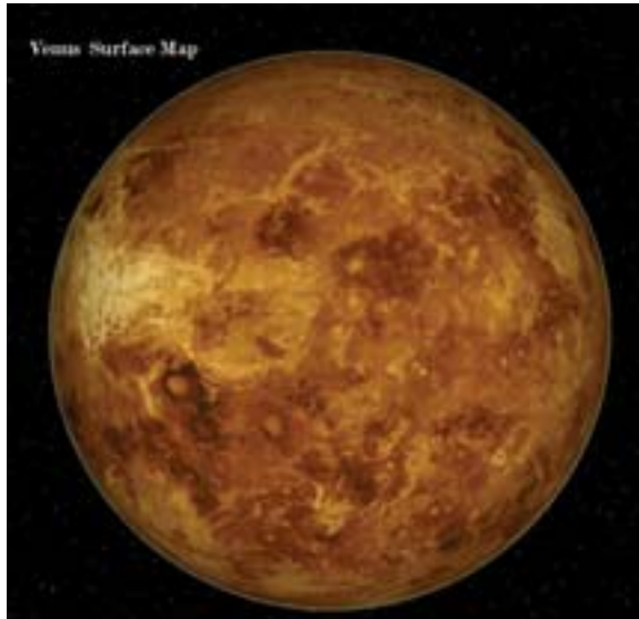
Surface map of Venus

Get ready for a Venus super show in the Sky Park because this week and next Venus is absolutely spectacular and will be at its very best for the entire year of 2006. In fact the old Farmer's Almanac describes this February appearance as "a morning star of great splendor" and Sky and Telescope magazine describes Venus as "a veritable lantern" in the sky. The participants in this past week-end's Walk-a-Thon could read their watch by the light of Venus it was so bright.