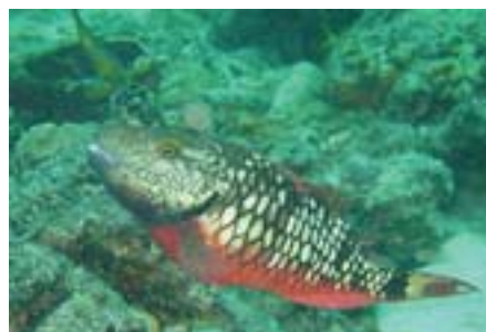
Stoplight Parrotfish The initial phase of the stoplight parrotfish is a very common fish on Bonaire, especially around coral rubble.