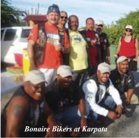
Bonaire Bikers at Karpata

(Walk-a-thon Triumph. Continued from page 6) end.