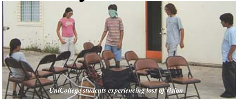
UniCollege students experiencing loss of vision