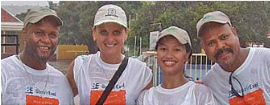
You can walk in a group