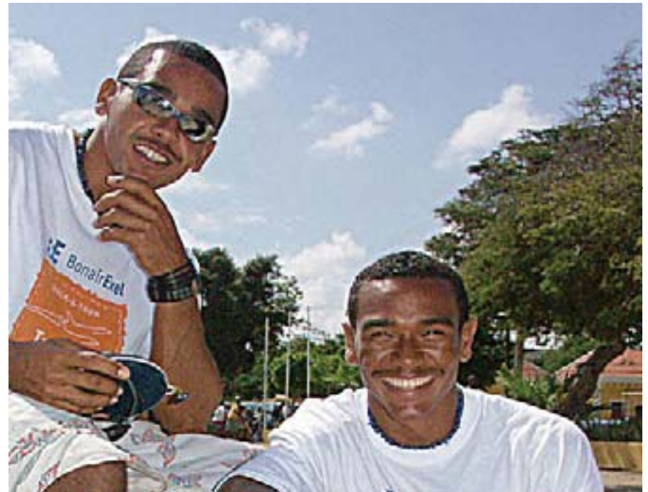
Tonky and Taty walked. You should too