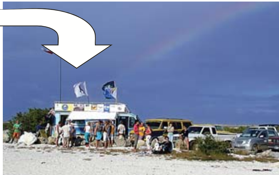
The kite bus can be found at the end of the rainbow or at Atlantis Beach.