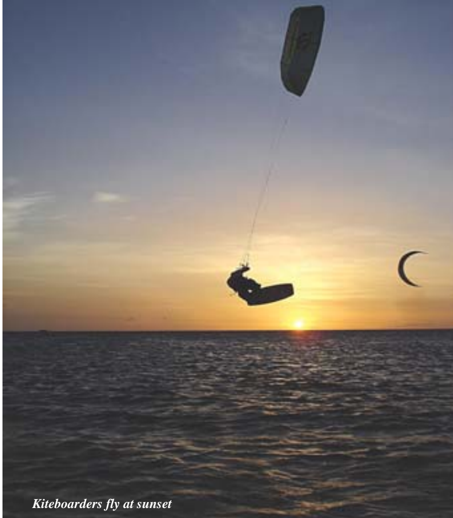
Kiteboarders fly at sunset