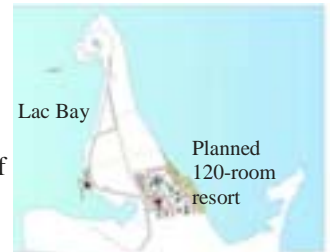
Sorobon Beach detail

► As we go to press we received a copy of a letter sent by the Bonaire Nature Alliance