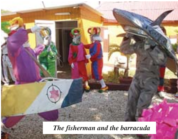
The fisherman and the barracuda

others say it's Indian. Still others say it's South American or even European. Culture guru Papi Cicilia suggests Spain: the "crowns" worn by the company represent the Spanish monarchy which ruled Bonaire for a time. That's also where the bull and the matador come from, he says. But of course the donkey, the kunukero and the fisherman in his boat are totally Bonairean.