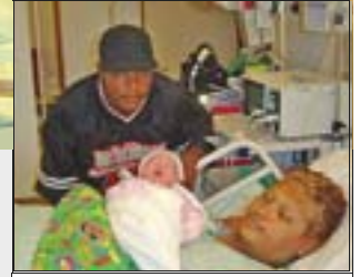
Proud parents and baby

you'll be welcomed at their office at Kaya Grandi 52 (across from Maduro Travel and Rento Fun Drive), or call phone: +599-717-6030