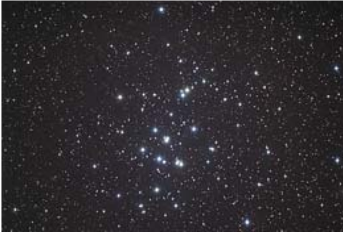
The Beehive Cluster (also known as M44) is located in the constellation of Cancer the Crab.

Mark this weekend as very special because you'll be able to use the Moon to find Saturn , which is at its brightest and closest to Earth this month and next for the entire year. Plus Jupiter will pay a super close visit to one of the scorpion's claws.