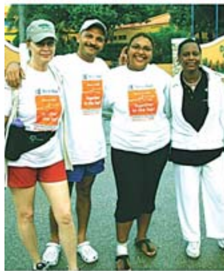
Special Olympics St.Martin joined last years' Walk-A-thon

First of all we would like to thank all of you who in some way has sponsored Special Olympics Bonaire in the past and also for all of you giving us your continuing support all these years! We really appreciate it! Thank you!