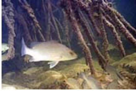
Snapper in mangrove roots in Lac Bay

(Flotsam & Jetsam. Continued from page 2) opments, upon request of concerned citizens, made a preliminary study of the environmental effects that can be expected from a hotel project.