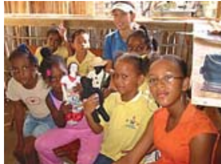
Skol di Bario

I feel very happy that you believe in our project and the effort we've made, giving our energy to this island that we all love so much.. Bonaire and especially Rincon...the heart of Bonaire...”