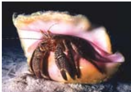
Harold, a bit overdressed?

banded antennae and handsome, stalked, blue-green eyes. Like other hermit crabs, the giant hermits are also called robber crabs because they are armor less animals and insert their abdomens into abandoned snail shells that they carry about with them for protection. The abdomens of the crabs are soft and asymmetrical, flexed and twisted to fit into the whorls of the borrowed shells. Harold's