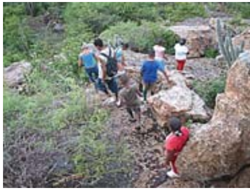
A Rincon nature tour walk