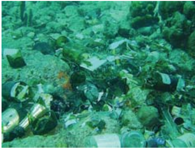
Overview of one section of the glass and other debris.