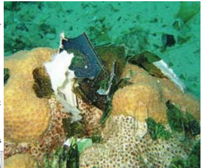
A close-up of a main coral victim, this-star coral head, showing all the glass shards that landed on top of it and fell into all its crevices.