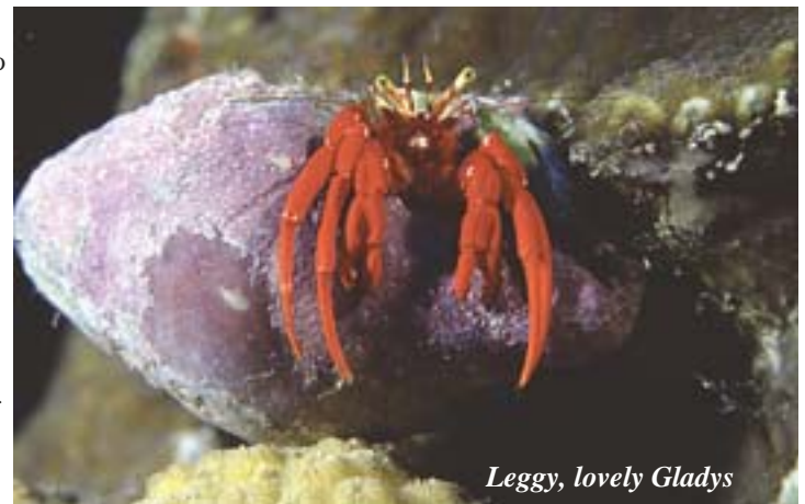
Leggy, lovely Gladys

Hermit crabs are often forced to seek new shells because they have outgrown their old ones; they change their housing whenever chancing upon another shell into which they can fit and carry it wherever they go, creating the ultimate "Mobile Home." Since hermit crabs are encased in a skeleton that does not grow, it must be shed or molted as they gain weight, making frequent housing changes and selection critical. However, problems