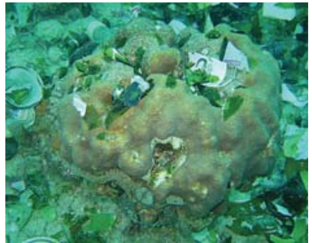
This poor star-coral head got the brunt of the tiniest glass shards, which fell into its every nook and cranny.