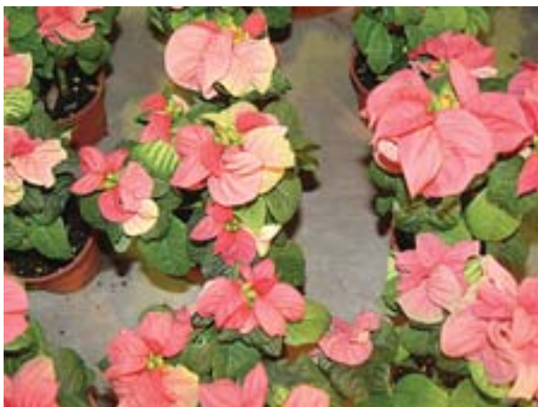
A red Euphorbia pulcherrima

In my last articles I wrote about creating a rock garden . Maybe after this week it would be better to write about creating a pond in your garden! Wow, did we have a lot of rain this week! I hope you didn't have too much flooding and none of your plants were washed away. As always, when I have to update you, here are some things to remember after this very nice rain, which is for the plants of course!