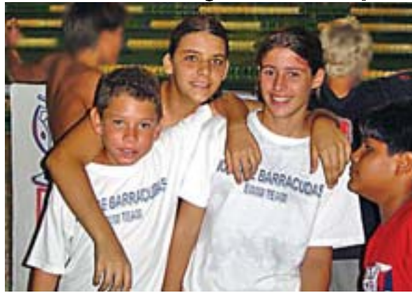
Swimming - a team sport

A team of 13 diehard Bonaire Barracuda age group swimmers along with their coaches and parents took the 6 am flight to Curaçao on November 12 to compete in the 3 rd Curaçao Open swimming competition of the 2005 - 2006 season. The team spent the hours before the meet at the Nederlands Antilliaanse Voetball Unie (NAVU) facility next door to the Sentro Deportivo Korsow (SDK) pool, preparing mentally and physically for the upcoming competition.