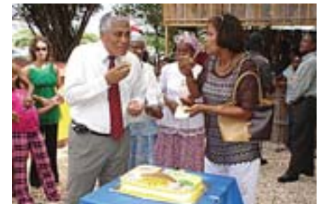
Lt. Governor Domacassé samples the cake

con. The kachu (male goat horn), which is used for different cultural purposes, is incorporated into the R of Rincon. After taking a look into the Kas Krioyo we could all enjoy the past meeting the future.: the Rincon Krioyo Kids . Yep, we are safe. The future generation definitely understands their past. Mission accomplished, Mo Tan.