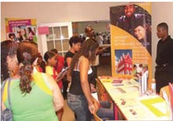
The University of the Netherlands Antilles was recruiting

Our own SGB was represented and is proud to now offer seven different vocational training programs: Cooking 2, Administration 2 & 3, Hospitality 2, Social Work with Children 2 & 3 and Electrical Engineering 3. The Hall was open all day to