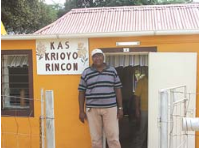
At the front door of the Kas Kyioyo