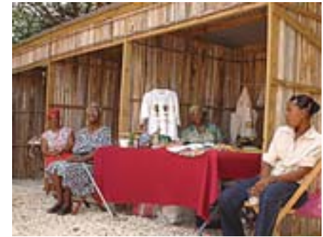
Part of the six-compartment Ramada