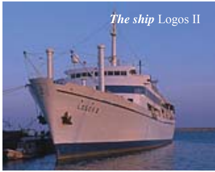
The ship Logos II