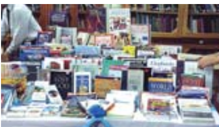
Lots of subjects to choose from