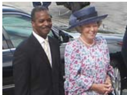
Emsley Tromp and Queen Beatrix

the island of Curaçao. The Central Government itself owes NAf 2.4 billion and, of that, it's been determined that Bonaire should be responsible for 10% of the total or NAf240 million, giving the island the highest debt-to-island product ratio of any Antillean island – growing from 44% to 127%. (For comparison: in the European Union, the norm is 60%)