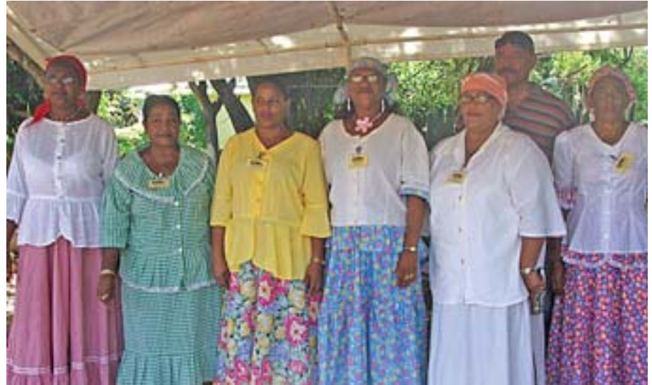
The members of the Kas Krioyo commission