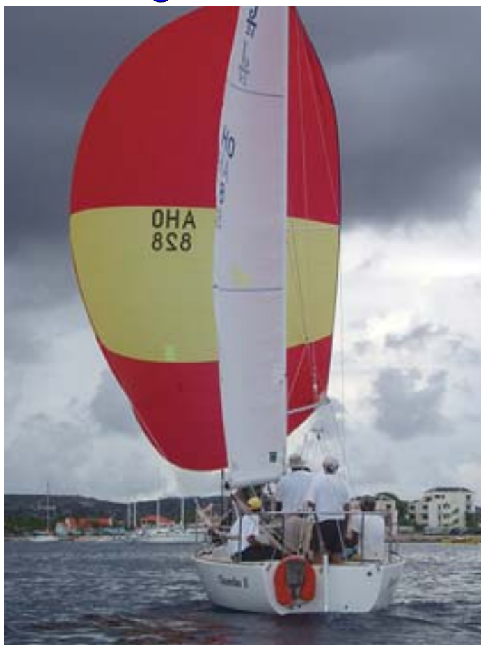
Chamba II—Always one of the top boats in the yacht fleet.

Sailors and non-sailors get together after the races at the festival, which offers exciting activities and live performances on the stage downtown. . G.D.