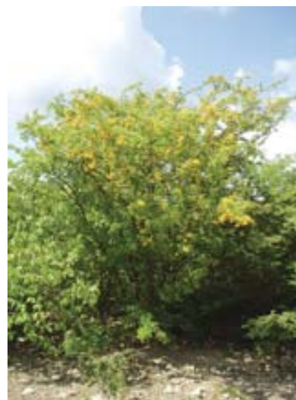
Brasilwood or Dyewood tree in bloom