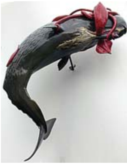
A Sperm Whale with a Giant Squid in its mouth.

(Flotsam & Jetsam. Continued from page 4)