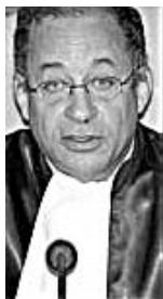
Judge Luis de Lannoy

► According to Central Statistics Bureau of the Netherlands Antilles, in Au-