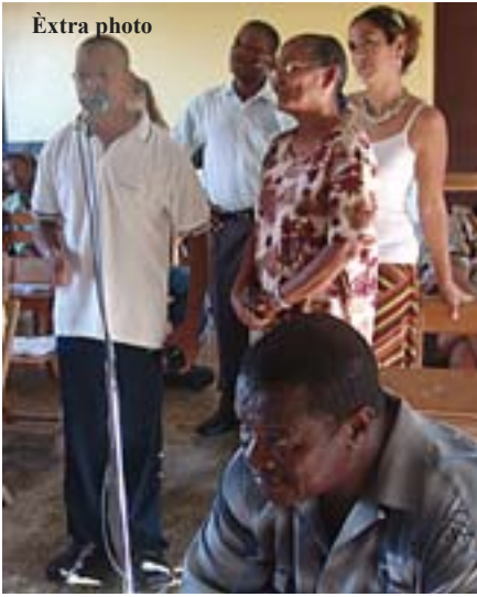
Some of the speakers at the Rincon Platforma meeting

(Platforma Rincon. Continued from page 6)