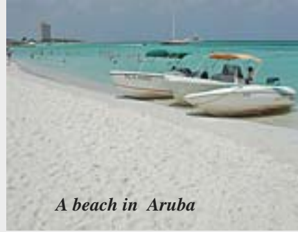
A beach in Aruba

On the local radio station I heard the last information concerning the plans to construct a new hotel on the site of the former Bonaire (Sunset Beach) Hotel. The island government is currently negotiating in this matter with the Marriott group, and there are also another two groups interested in building a hotel on this site - Radisson and Hilton. As expected, the stumbling block is the condition put by Marriott, and certainly also by the other groups for the beach in front of