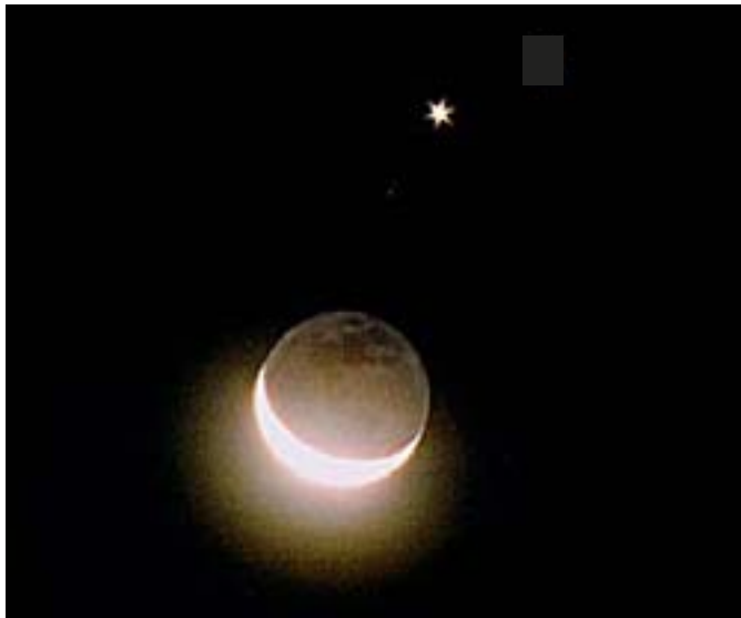
Moon under Venus on October 6 th