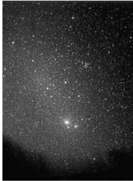
The Gegenschein – a picture of a rare phenomenon at midnight. It appears as a very light and elongated region extending over 10-15° in length and a few degrees wide along the plan of the ecliptic.