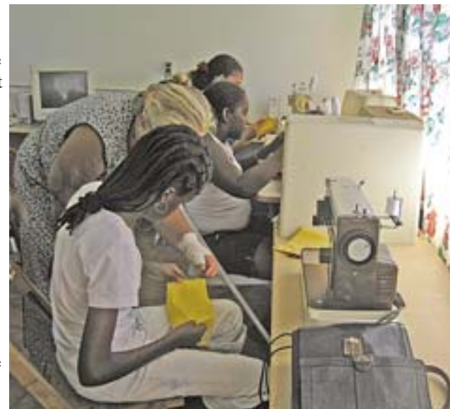
A volunteer teaches sewing skills

training using a structured program with a vocational focus. These are select programs that help the young adults. They're not just programs that the leaders enjoy doing. First aid, swimming, snorkeling, diving, boat handling, computer, sewing, taekwon-do, cooking, serving, reception, housekeeping, landscaping, maintenance, trade skills, building, plumbing, electrical are among the possible offerings.