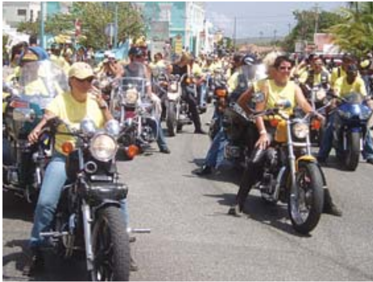
Start of the island tour in Kralendijk.