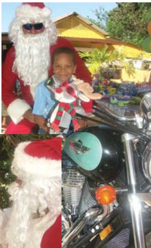
Santa puts this youngster in the driver's seat