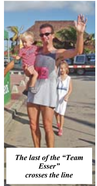
The last of the "Team Esser" crosses the line