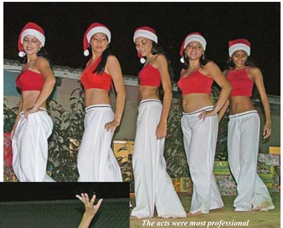
The acts were most professional