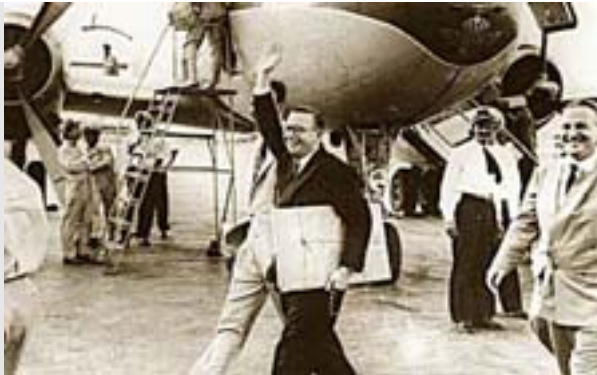
1954. Back then Minister-President of the Netherlands Antilles, Efrain Jonckheer, returns after signing the Statute in The Netherlands - 50 years ago December 15 th .

► For the third year in a row, readers of Scuba Diving magazine have named Bonaire as the Top Dive Destination in the Caribbean/Atlantic . The 2005 Readers' Choice Awards were recently announced in the January/February issue. Bonaire also received the highest scores in the following categories: Top Marine Life, Top Shore Diving, Top Snorkeling, Top Destination for Underwater Photography and Top Beginner Diving.