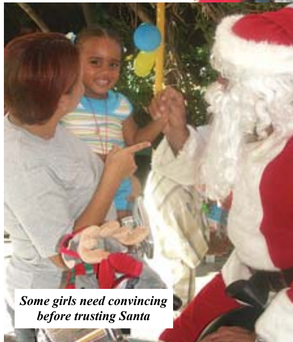
Some girls need convincing before trusting Santa