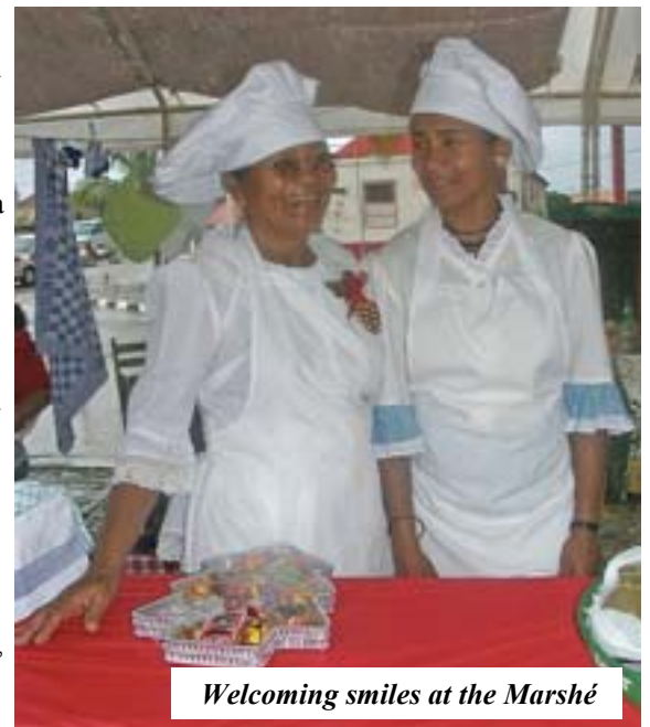
Welcoming smiles at the Marshé

After five years of existence, Marshé Rincon is alive and kicking.