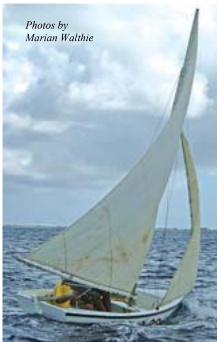
A dying breed-the Bonaire fishing boat -under sail

Sunfish, Optimists, windsurfers, Hobie Cats, catamarans and fishing boats joined the 'End of the Year' Regatta last Sunday in Playa at 'Kas di Regatta.' Except for the Optimists all the other racers rounded Klein Bonaire in a relaxed race where to participate was more important than winning. No trophies are awarded at this regatta. It is unique on Bonaire because the prizes are items related to the holiday: hams,