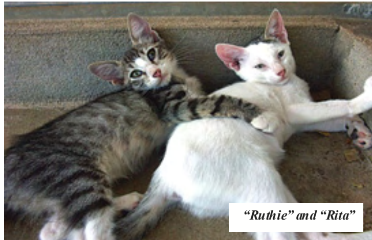
"Ruthie" and "Rita"

K itten sisters, "Ruthie" and "Rita" strike a pose to show how much they love each other. White-furred Rita with a black splash of color on one ear doesn't look much like her sister, Ruthie, who