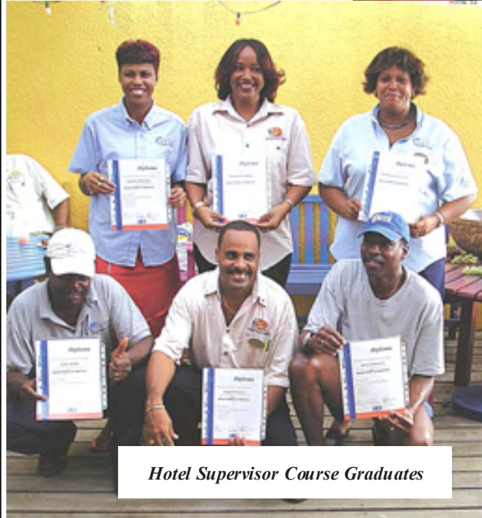
Hotel Supervisor Course Graduates