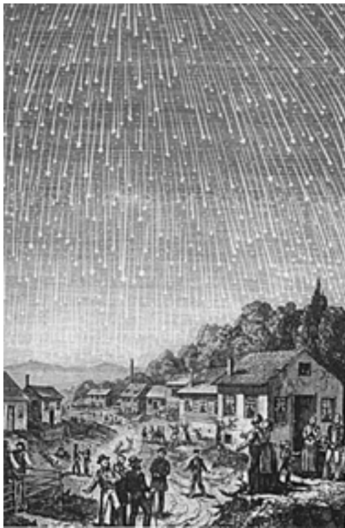
Engraving of 1833 meteor storm-made over 10 years later